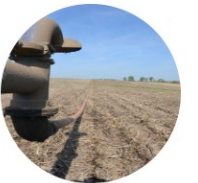
NRCS CPS 590 Nutrient Management