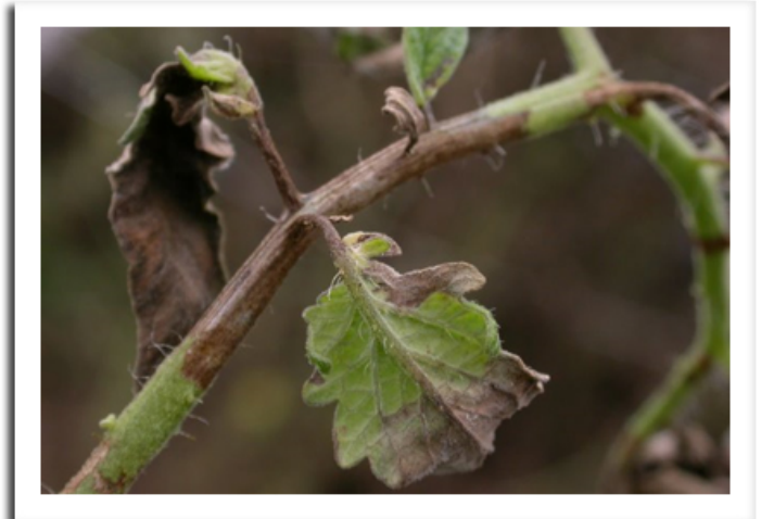
Late blight on tomato

disease from developing in tomato and potato crops as harvest accelerates. A second case of late blight was confirmed by the UW this week, in a commercial tomato planting in Pierce County. This case follows the season’s first report on tomato in Waukesha County on July 26. All potato growing areas in the state have exceeded the threshold for late blight management and fungicidal protection of susceptible tomato and potato crops is recommended at this time.