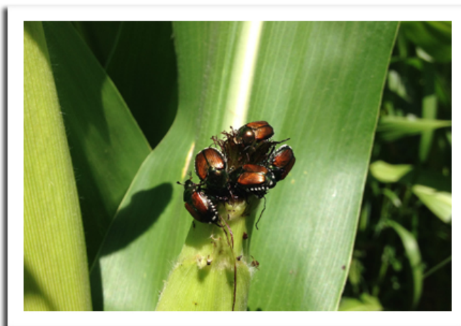
Japanese beetles feeding on corn silks

JAPANESE BEETLE: This insect is still common in the cornfield margins across much of the state. Beetles per ear were noted this week from Walworth to Eau Claire County. As a reminder, a field-wide average of three or more beetles per ear is considered high and may be a concern for fields not yet pollinated.