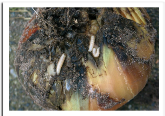
Onion infested with onion maggot larvae

ONION MAGGOT: Late-summer flies are emerging across southern Wisconsin. Emergence is expected to begin next week in the central areas, following the accumulation of 3,230 degree days (base 40°F). Larvae from this third and final generation will overwinter in cull onions or bulbs left behind in fields. Proper sanitation and rotating to a non-crop host are recommended for growers who experienced onion maggot problems earlier this season.