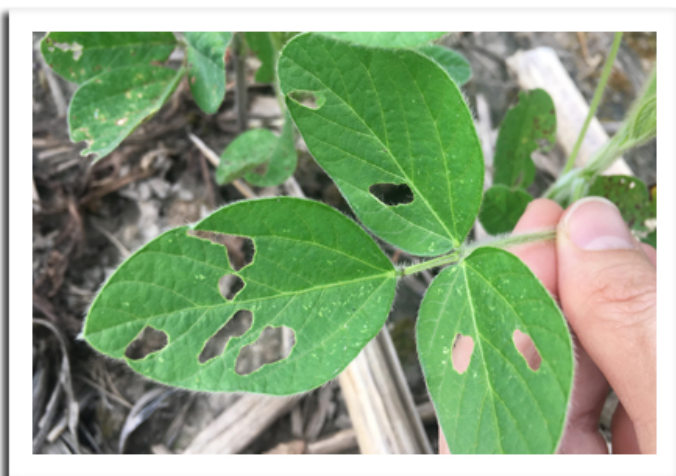
Green cloverworm defoliation

GREEN CLOVERWORM: Larvae ranging from mid- to late-instar were found at low levels in the southern and western counties. Defoliation levels in surveyed fields were minor at less than 5-10%. This sporadic soybean pest is highly susceptible to parasitism and disease, and is normally controlled biologically without insecticide use.