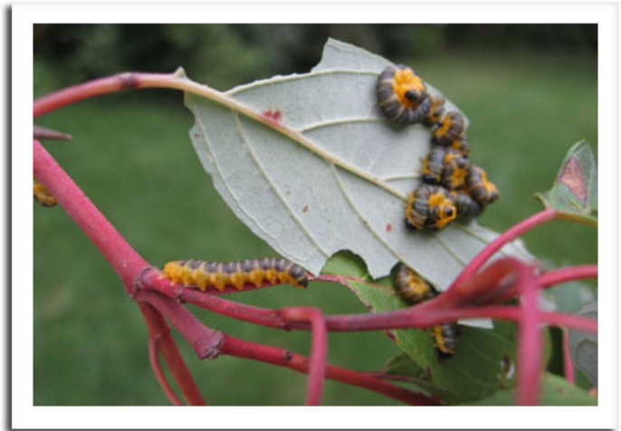
Dogwood sawfly larvae on redosier dogwood Konnie Jerabek DATCP

against early-instar larvae (less than ¾ inch), but that treatment window has closed for this season. Varieties most susceptible to sawfly infestation are the gray and redosier dogwoods.