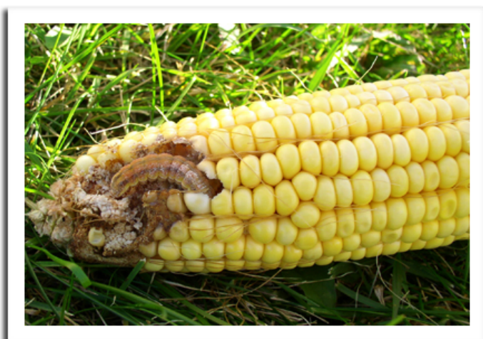
Corn earworm larva

fresh-market sweet corn growers should continue to monitor silking sweet corn fields and follow CEW flight reports through early September.