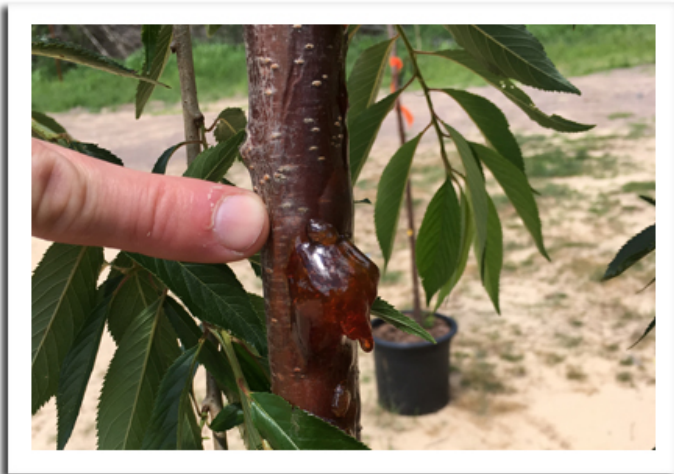
Gummosis on weeping cherry

CHERRY TREE GUMMOSIS: Exuded sticky, amber-colored gum or sap, referred to as gummosis, was noted on container-grown 'Pink Snow Showers' weeping cherry trees in a Wisconsin growing field. Gummosis is a tree's defense response to insect, bacterial, or abiotic stress and is often associated with cankers caused by mechanical injuries (such as contact with mowers or pruning), insects, winter damage, sunscald, herbicide injury, and various other fungal or bacterial infections. This disorder is most common on stone fruit trees such as cherries, nectarines, plums and peaches. Severe damage or infection may cause systemic wilting and eventual death of fruit-bearing wood. Prevention is best accomplished using an integrated management approach: avoiding mechanical injuries, pruning under dry conditions, providing a good growing site with well-drained soils and balanced fertilization. Practicing good sanitation by proper pruning and destroying cankered limbs is key.