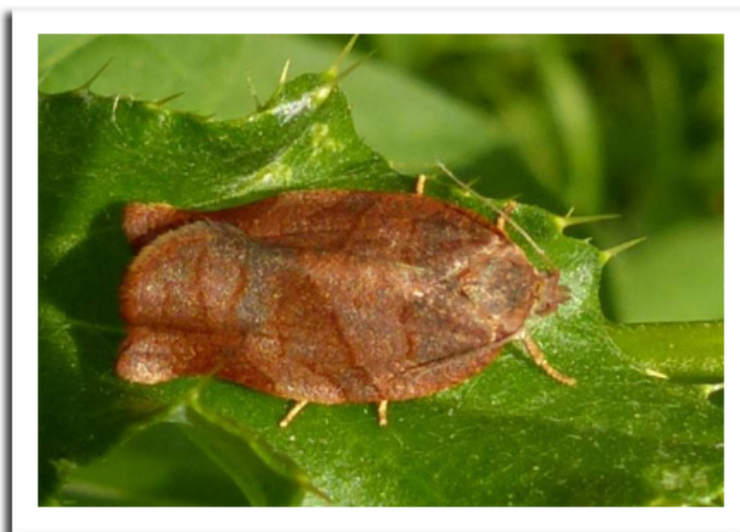
Obliquebanded leafroller moth