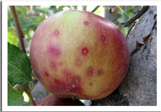
San Jose scale fruit damage

SAN JOSE SCALE: Second-generation crawlers are active and continued monitoring is suggested. Damage by this pest can increase exponentially from one generation to the next, and problems may persist through mid-September. As harvest begins, it is recommended that growers examine fruits for the “black cap stage” adults and maintain tape on infested limbs. A count of 10-15 scale crawlers over a few days or 10 crawlers on one tape with zero on all other tapes, may warrant application.