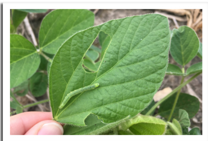
Green cloverworm larva

GREEN CLOVERWORM: Larvae are appearing in southern and western Wisconsin soybean fields. Numbers are still low and defoliation is light (<2% fieldwide), but outbreaks of this caterpillar occur every 5-6 years and conditions are favorable for damaging populations to develop this season.