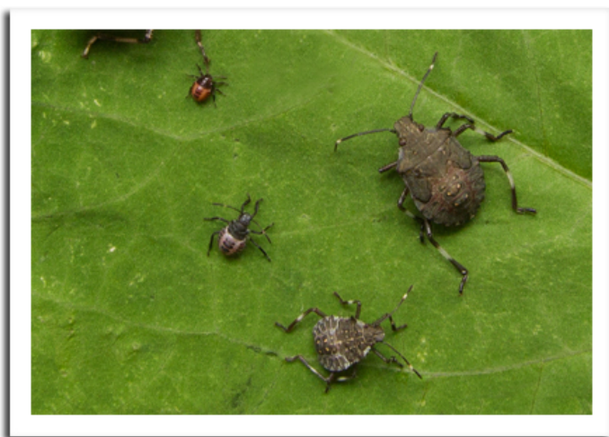
Brown marmorated stink bug nymphs