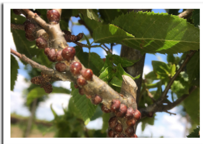
Lecanium scale on American hornbeam

SCALE INSECTS: An assortment of scale insect species were found this week, including Euonymus scale on American, Fletcher scale on ‘Techny’ Arborvitae, and Lecanium scale on American hornbeam. Adult scales develop a waxy covering impenetrable by insecticides, therefore any insecticide treatment must target the immature mobile crawlers. For the Euonymus scale, the period of mobile crawler activity is forecast to begin next week (July 16-22). Severe infestations can be controlled with horticultural oils, insect growth regulators, or conventional insecticides as soon as the presence of crawlers is confirmed using a 10X hand lens. Natural enemies are also helpful in reducing scale populations.