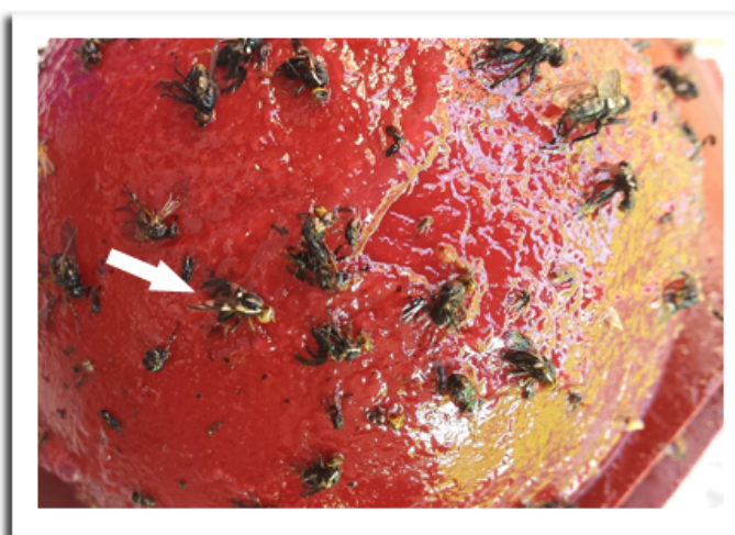
Apple maggot fly on a red sphere trap

APPLE MAGGOT: Emergence of flies continued for the second week, with a high count of 5 flies on red sphere traps reported from Grant and Sheboygan counties. Captures have also occurred in Bayfield, Dane, Fond du Lac, Marathon, Pierce, and Racine counties. Apple orchards affected by recent hailstorms are at increased risk of infestation by this pest since hail-damaged fruits release volatiles that can attract flies from long distances. Maintenance of traps will be important as emergence continues and oviposition on apples increases in late July and early August.