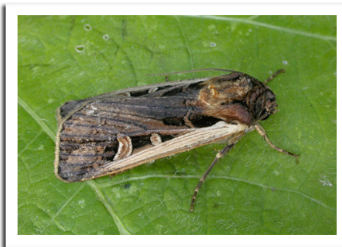
Western bean cutworm moth

masses and small larvae are found on 5% or more of the corn plants, an insecticide treatment applied at 90-95% tassel emergence will be most effective. This application timing increases the chance that the caterpillars will be exposed to the insecticide. Routine scouting should continue throughout the month.