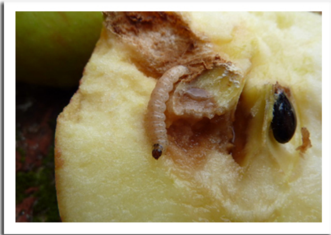
Codling moth larva

CODLING MOTH: Counts have decreased in most orchards as the first flight subsides. Orchardists who have not observed a distinct decline in moth activity and are having difficulty determining the most effective treatment window should use an accumulation of 1,000 degree days (modified base 50°F) from the spring biofix in late May to time the start of larvicide applications. As a general rule, approximately 1,000 degree days are required between the first and second larval generations.