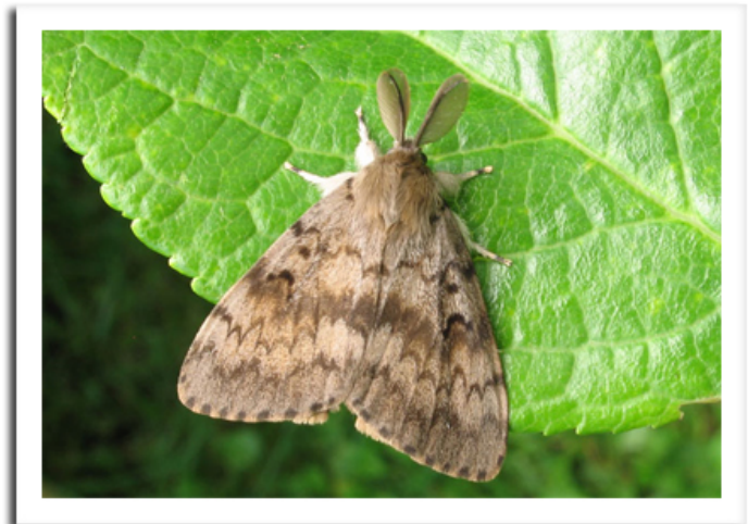
Male gypsy moth butterfly-conservation.org

GYPSY MOTH: The annual moth flight began on July 5 in Dane County, and moths have since been reported from Adams, Grant, Juneau, Richland and Winnebago counties. Trap setting by the DATCP Gypsy Moth Trapping Program was completed on July 7. A total of 10,901 traps have been placed in 48 counties this season. Trappers have started trap check procedures south of Highway 21. Monitoring of traps located north of Highway 21 will begin once moth emergence is confirmed in that region.