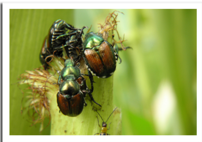
Japanese beetles feeding on corn silks

JAPANESE BEETLE: A heavy emergence is underway. Beetles are abundant in corn, soybeans, and fruit crops, and damage is expected. Moderate counts of 50 beetles per 100 plants were found in the edges of a few cornfields in Monroe County this week, and beetles were observed at about 35% of the sites surveyed. For corn, the primary concern is to protect the silks from clipping since heavy beetle feeding on corn silks can impair pollination. Treatment may be justified for fields with three or more beetles per ear and silks that have been clipped to ½ inch when pollination is occurring (less than 50% complete). Japanese beetles aggregate on plants in the edge rows, emphasizing the importance of obtaining a representative sample from several areas throughout the field before making control decisions. Border row spot treatments may be sufficient if the beetles and damage are confined to the field edges. Beetles must be on the outside of the ear to be killed by contact insecticides.