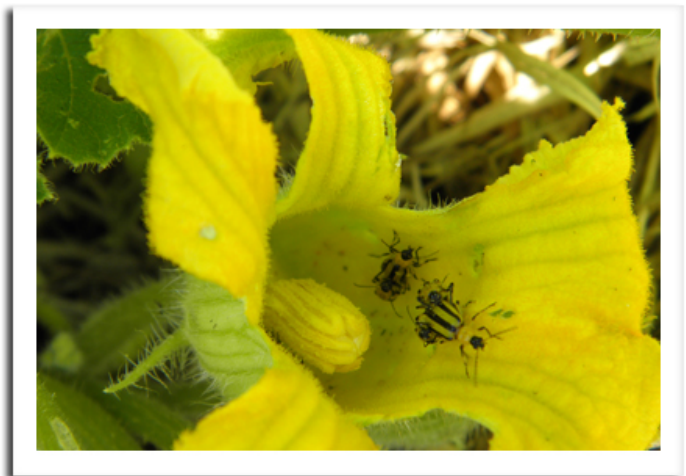
Striped cucumber beetles inside squash blossom Krista Hamilton DATCP

STRIPED CUCUMBER BEETLE: Adults are emerging in greater numbers in the southern half of the state. Growers of cucurbits should continue to monitor plants for these yellow and black striped beetles, which may transmit bacterial wilt of cucurbits through feces or contaminated mouthparts. Control is warranted for populations of one beetle per plant in melons, cucumbers and young pumpkins, and five beetles per plant for less-susceptible cucurbits such as watermelon and squash.