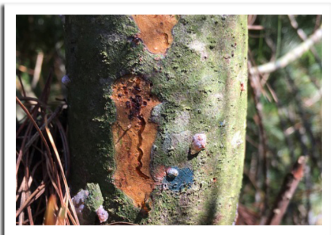
Pine bark beetle damage on white pine Shanon Hankin DATCP

PINE BARK BEETLE: Evidence of bark beetle infestation was found on balled-and-burlapped (B&B) eastern white pines at a southern Wisconsin nursery stock dealer. Trees stressed by drought and heat exposure from prolonged B&B storage are especially attractive to bark beetles, which create galleries that structurally weaken trees and holes in the bark that allow pathogenic fungi and bacteria to invade and cause disease. Bark beetle-infested pines should be removed from sale and destroyed to prevent further spread. Prevention of bark beetle infestations in pine includes keeping B&B trees well-watered and optional insecticide treatment prior to digging.