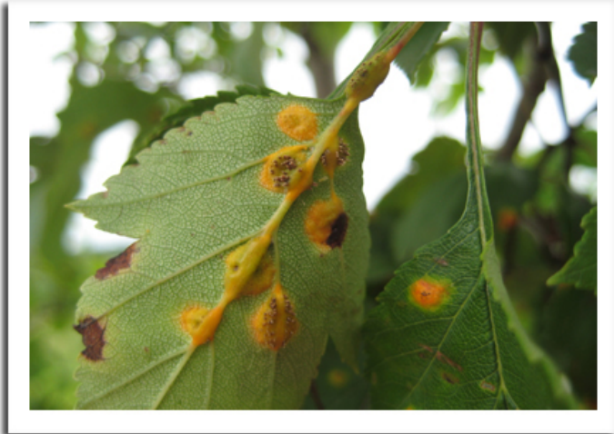
Cedar-hawthorn rust on hawthorn DATCP Nursery Program

severely infected branches are the recommended controls. Trees can be protected from infection by fungicide treatments in spring and early summer. Junipers may be treated with a Bordeaux mixture every two weeks beginning in mid-summer.