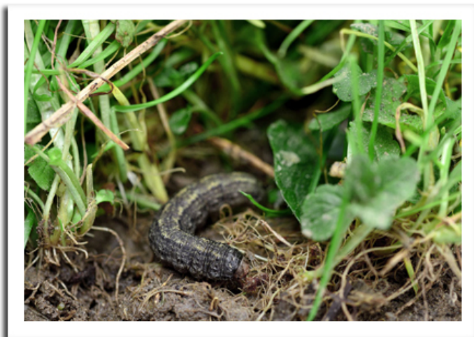
Black cutworm larva

for the week was 41 moths near Dodgeville in Iowa County. Early evidence of cutworm feeding could become detectable in emerging southwestern Wisconsin cornfields over the weekend of May 19-20, and the primary cutting window is expected to open in full by May 23 across much of the southern half of the state.