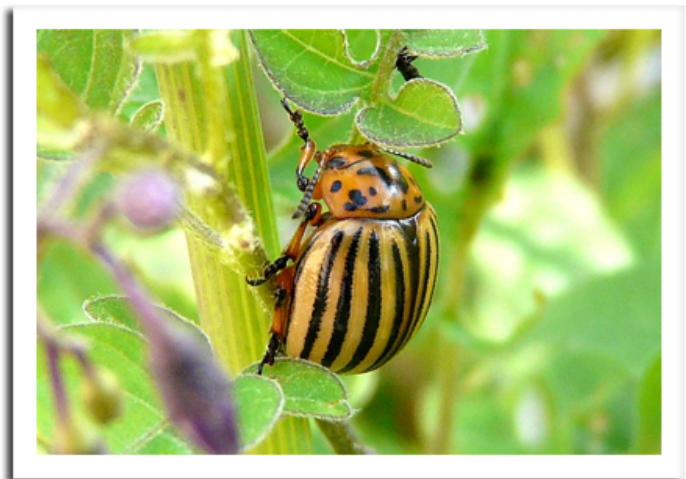
Colorado potato beetle

can be expected by the third week of May. The orange-yellow eggs are deposited in clusters of 15-30 on the undersides of leaves.