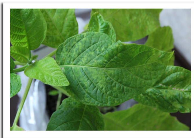
Tobacco rattle virus in angel trumpet

PLANT VIRUSES: Plant viruses continued to dominate nursery inspection reports across the state. Potyvirus was confirmed in several Iris and sedum varieties at locations in Jefferson, La Crosse, Rock, and Washington counties. Tobacco Rattle Virus (TRV) was diagnosed in angel's flower and bleeding heart in La Crosse, Racine, and Waukesha counties, while rose cardinal flower from a Washington County greenhouse tested positive for cucumber mosaic virus.