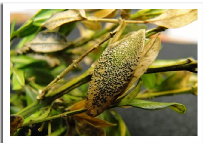
Macrophoma leaf spot on boxwood

MACROPHOMA LEAF SPOT: This weakly parasitic fungal disease was observed on boxwood “Green Velvet” in Kenosha County last week. Macrophoma leaf spot threatens poorly-maintained or infrequently-pruned boxwood plants, and like many fungi, thrives in the cool, dark interior of the plant. The most obvious symptoms are the many tiny black raised fruiting bodies found on dying or dead straw-colored leaves. The spreading fungus defoliates new growth, with the potential to kill entire branches within a few weeks.