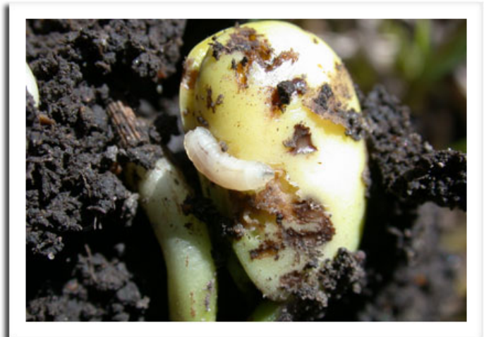
Seedcorn maggot larva

SEEDCORN MAGGOT: Emergence of first-generation flies has peaked statewide with the accumulation of 360 degree days (sine base 39°F). Heavy egg laying may still occur for another week in areas north of Wausau, but should be declining across the south.