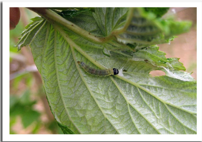
Obliquebanded leafroller larva

OBLIQUEBANDED LEAFROLLER: Larvae are appearing after overwintering under the bark of scaffold limbs and twigs. The ¼-inch, yellowish-green caterpillars with black head capsules will feed for 2-3 weeks before pupating within leaf tubes. Apple growers should set OBLR traps by early next week.