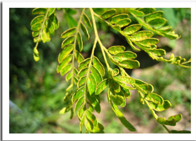
Honeylocust plant bug damage

Most of the feeding damage caused by this pest occurs before the leaves have fully developed, so early treatment is critical. Nymphs can be controlled chemically with horticultural oil or insecticidal soap, or physically, with a high-pressure sprayer. Honey locust cultivars with yellow leaves are generally more susceptible to plant bugs than varieties with green leaves.