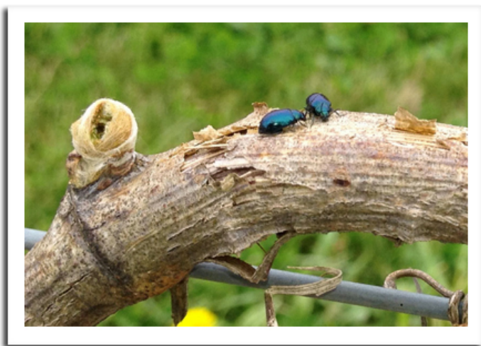
Grape flea beetles and bud injury

GRAPE FLEA BEETLE: The spring migration of overwintered beetles into vineyards has started. Scouting twice weekly from bud swell until the first leaf separates from the shoot tip is suggested through mid-May, or once shoot growth has reached three inches. Early spring feeding by adult flea beetles damages primary buds, preventing shoot expansion and ultimately reducing grape yields. Plants on the margins of vineyards are at greatest risk of injury. An economic threshold of 5% bud damage can be used to determine the need for control.