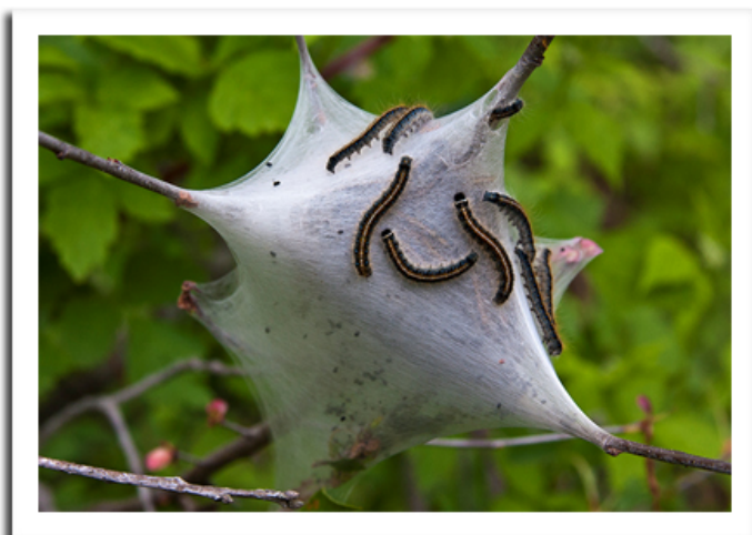
Eastern tent caterpillar

EASTERN TENT CATERPILLAR: Larvae have been active since late March. The tents now appearing on apple, ornamental crabapple, wild cherry, and other host trees should be manually removed during the next two weeks. Pruning infested branches is unnecessary and is not advised.