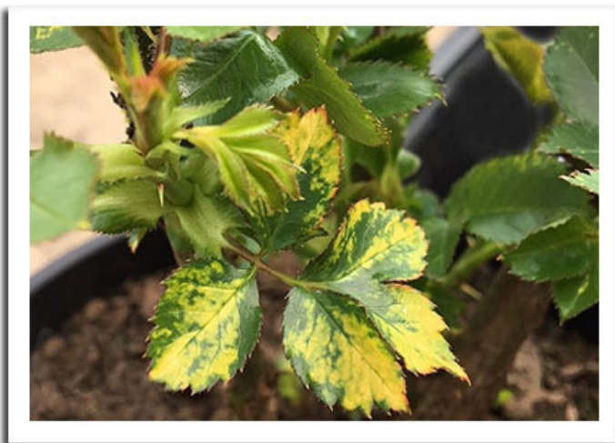
Apple mosaic and Prunus necrotic ringspot viruses on rose Tim Boyle DATCP

ROSE VIRUSES: Rose plants testing positive for apple mosaic virus and Prunus necrotic ringspot virus arrived in Wisconsin last month in a shipment originating in Arizona. The roses harbored both viruses on the same individual plants, which exhibited characteristic yellow chlorotic mottling on the dark green leaves. Necrotic and chlorotic local lesions, mosaic patterns, and ringspots are also typical with these diseases. Both types of viruses can be transmitted by mechanical inoculation and through grafting. Virus-infected roses are less vigorous, more susceptible to winter mortality, and should be removed from sale and destroyed or returned to the supplier.