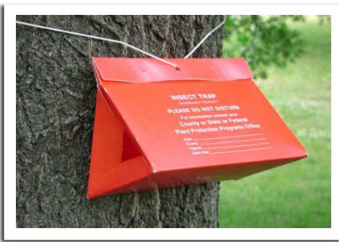
Gypsy moth trap

GYPSY MOTH: Approximately 11,000 pheromone traps will be set in the western half of the state this season to evaluate gypsy moth populations. Trap deployment is scheduled to begin during the week of May 8 and should be complete by early July. Landowner cooperation in allowing traps to be set on their property is imperative to the success of the annual trapping survey.