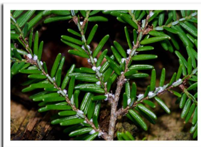
Hemlock wooly adelgid

HEMLOCK WOOLY ADELGID: Nursery stock dealers and growers are reminded that DATCP has enacted an exterior quarantine (ATCP 21.16) regulating the entry of hemlock plant material from states infested with hemlock wooly adelgid (HWA). This aphid-like insect has caused widespread mortality of eastern and Carolina hemlock trees from Maine to Georgia and now occurs in 19 states, including neighboring Michigan where there are 14 known active populations in five southwestern counties. Eradication of HWA may be possible if an infestation is detected early, but preventing introduction of HWA into the state is preferred. Nursery operators should closely inspect hemlocks purchased from an out-of-state nursery and report any suspicious hemlock trees to a DATCP Nursery Inspector.