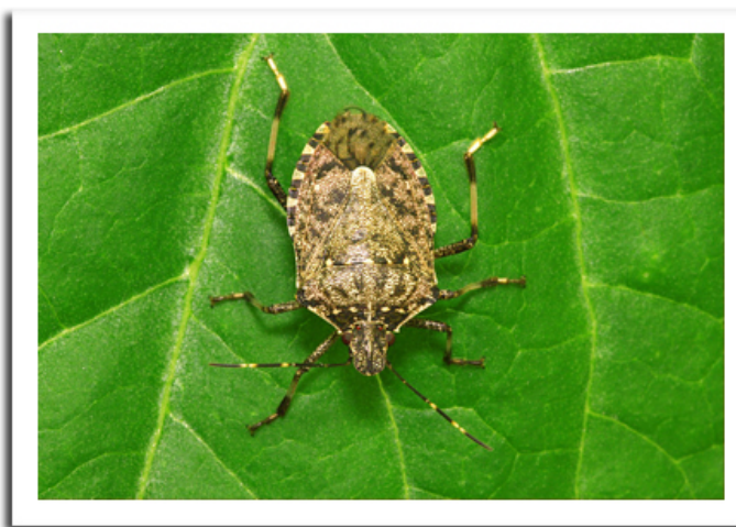
Brown marmorated stink bug

nomics crops are at risk as this invasive pest becomes more widely distributed in the state. Feeding by BMSB on soybean pods and seeds results in 'stay green' symptoms, or soybeans that do not produce harvestable yields. Crop advisors and soybean growers should be alert for BMSB in 2017 and send any suspects to the UW Insect Diagnostic Lab for identification. Minnesota confirmed its first detection of BMSB in soybeans last August, in Dakota County bordering northwest Wisconsin.