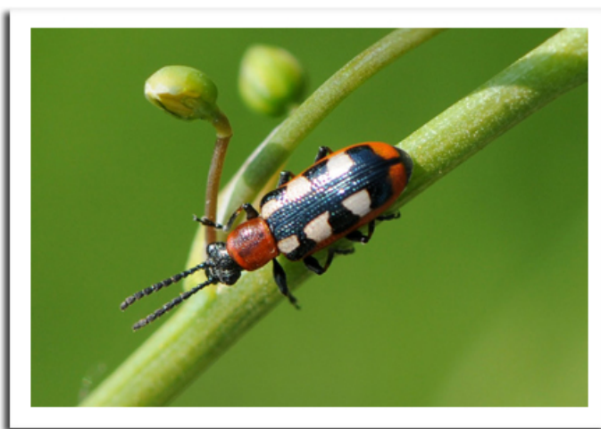
Common asparagus beetle

COMMON ASPARAGUS BEETLE: Beetle emergence and egg deposition on asparagus spears have begun near Beloit, La Crosse, Platteville and other advanced southern and western locations. Plants should be examined for adults and eggs on warm, sunny afternoons when the beetles are most active. Control may be considered if 5-10 beetles are found per 100 spears or if eggs are present on at least two of 100 spears, ferns, or flower buds. Eliminating the adults early in spring, before significant egg laying has occurred, is the most effective management strategy.