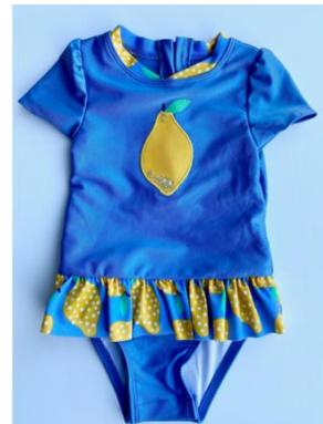
Target Recalls Infant-Toddler Girl’s One-Piece Rashguard Swimsuits Due to Choking Hazard | CPSC.gov

What to do: Consumers should immediately take the recalled one-piece Rashguard swimsuits away from children and return them to any Target Store for a full refund. Consumers that purchased the one-piece Rashguard swimsuit on Target.com can contact Target to receive a prepaid return label to return the swimsuit. Consumers can contact Target at 800-440-0680 from 7 a.m. to 8 p.m. CT, daily or online at www.target.com and click on “Recalls” at the bottom of the page, then on “Clothing” for more information. Consumers can also click the “Product Recalls” tab on Target’s Facebook page for more information.