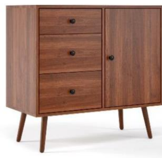
Homfa Cabinets Recalled Due to Tip-Over and Entrapment Hazards; Made by Shenzhen Luosi Ge Trading Co. (Recall Alert) | CPSC.gov

What to do: Consumers should immediately stop using any recalled cabinet that is not properly anchored to the wall and keep it away from children. Homfa will provide pre-paid shipping labels, so that consumers can remove the cabinet's drawer slides and return them to the firm for a full refund. Consumers should then discard the rest of the dresser. The firm is contacting all known purchasers directly. Consumers can contact Homfa by email at: service@myhomfa.com . Homfa will send emails directly to all customers that purchased the recalled product with instructions on how to receive a full refund. Homfa will send the emails to the email address associated with the account that purchased the product.