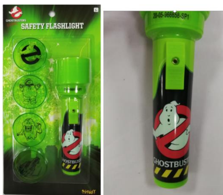
Spirit Halloween Recalls Children's Flashlights Due to Fire and Burn Hazards | CPSC.gov

What to do: Consumers should immediately take the flashlight away from children, stop using it, remove the batteries and dispose of the flashlight; and contact Spirit Halloween for a full refund. Consumers can contact Spirit Halloween toll-free at 866-586-0155 from 9 a.m. to 5:30 p.m. ET Monday through Friday, email at GuestServices@spirithalloween.com or online at www.spirithalloween.com and click on product recall at the bottom of homepage for more information.