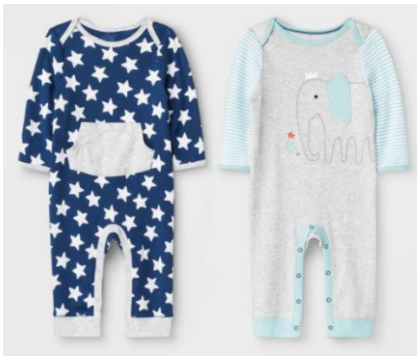
Target Recalls Infant Rompers Due to Choking Hazard | CPSC.gov

What to do: Consumers should immediately take the recalled infant rompers away from children and return them to any Target Store for a full refund. Consumers that purchased the rompers on Target.com can contact Target to receive a prepaid return label to return the rompers. Consumers can contact Target at 800-440-0680 from 7 a.m. to 8 p.m. CT, daily or online at www.target.com and click on “Recalls” at the bottom of the page, then on “Clothing” for more information. Consumers can also click the “Product Recalls” tab on Target’s Facebook page for more information.