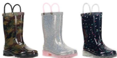
Model T24121725P Model T24121728P Model T24121729P

Washington Shoe Company Recalls Western Chief Toddler Boots Due to Choking Hazard; Sold Exclusively at Target | CPSC.gov