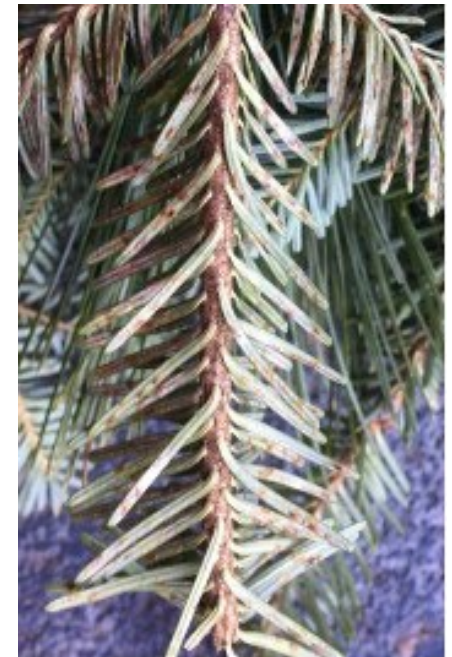
The brown spots visible on the needles are the "scale" covering immature insects