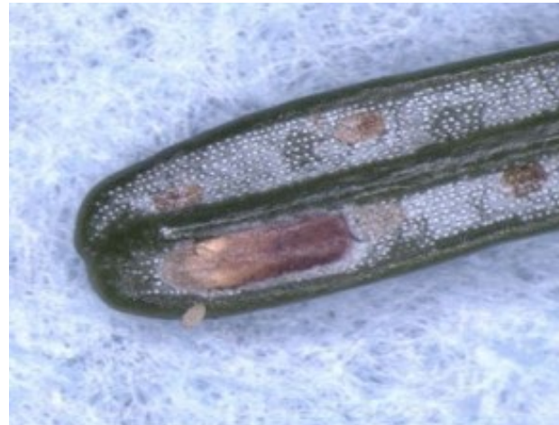
A microscopic view of EHS

EHS has not been found on the landscape in WI. Please report suspected introductions of EHS to DATCP immediately via email: datcppesthotline@wi.gov .