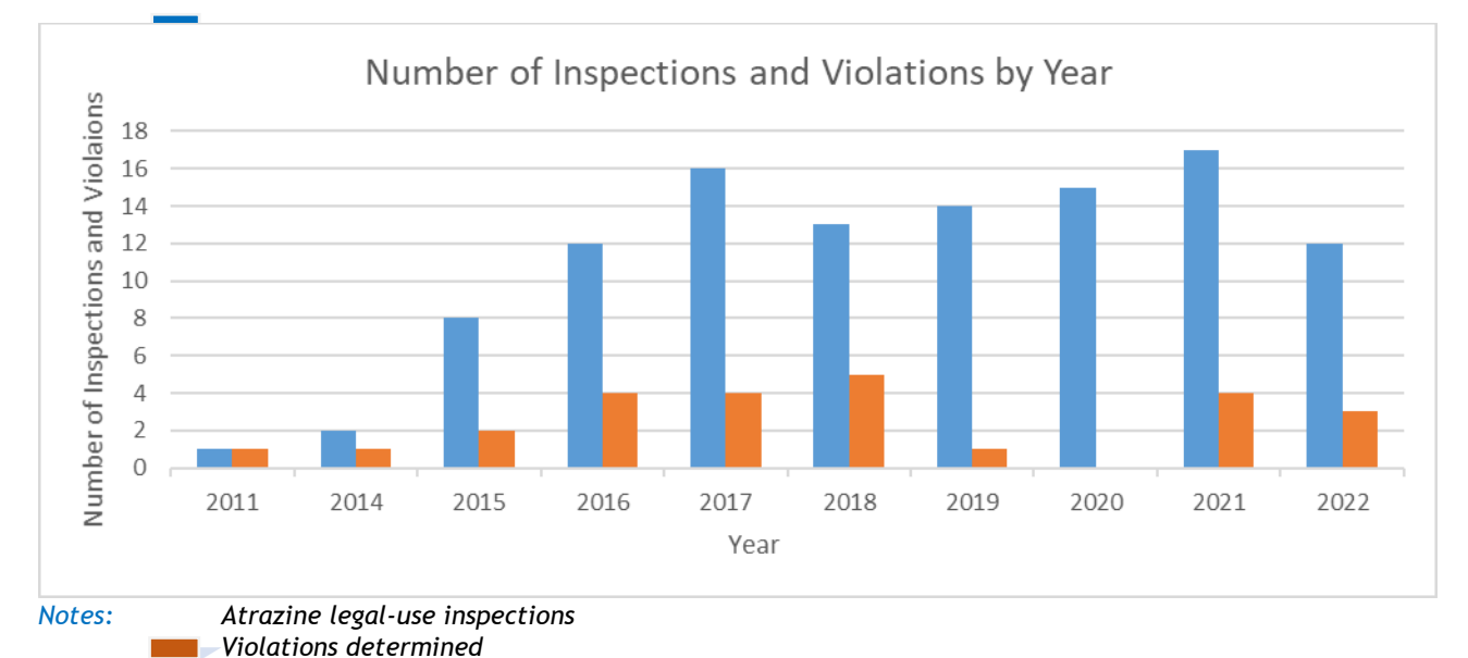
Figure 3: Atrazine Legal-Use Inspections and Violations

A summary table of the atrazine legal-use inspections over the years is included in Appendix B.