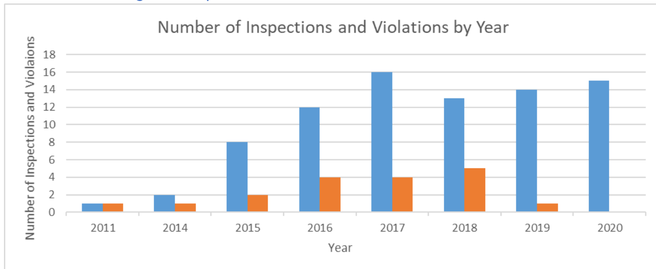
Table 4: Atrazine Legal-Use Inspections and Violations

Notes: ■ Number of atrazine legal-use inspections within stated year. ■ Number of violations associated with an atrazine legal-use inspection within the stated year.