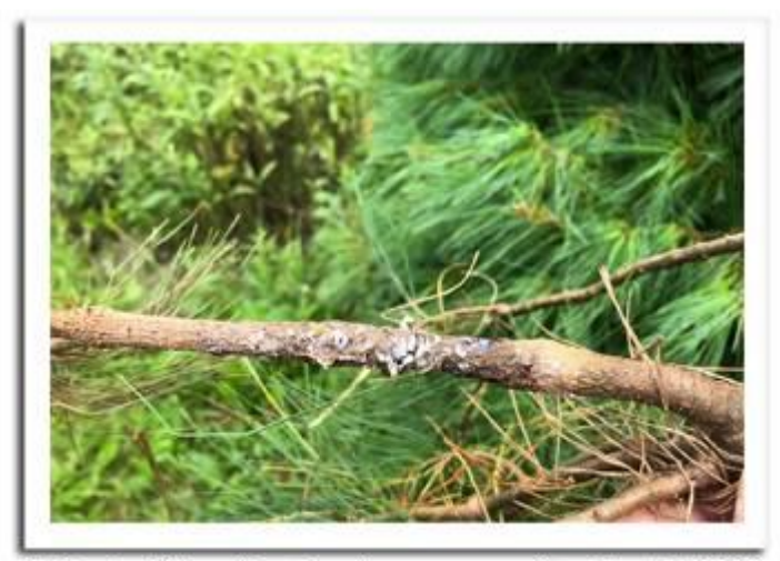
White pine blister rust shoot symptoms

WHITE PINE BLISTER RUST: Nursery inspectors recommend scouting white pine fields during the growing season for brown shoots and other signs of white pine blister rust (WPBR) infection. Trees with off-colored or brown shoots should be checked on the interior stem for developing symptoms of WPBR, such as swollen discolored stems with rust pustules emerging from the bark. Cutting off the branch close to the trunk and promptly disposing of the infected material can limit the movement of this fungus into the trunk and prevent it from girdling the tree. The alternate host plants for WPBR are in the Ribes genus (gooseberry and currant).