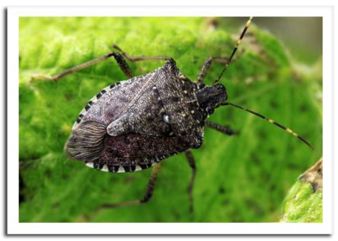
Brown marmorated stink bug

As BMSB populations continue to increase and spread in Wisconsin, on-site monitoring will be the best determinant of whether or control is necessary. An economic threshold for clear sticky panel traps is not yet available. However, USDA-ARS Research Entomologist Dr. Tracy Leskey has specified a provisional threshold of 10 BMSB per week for black pyramid traps to apply an alternate-rowmiddle spray, noting that the occasional BMSB caught in traps may not warrant BMSB sprays and growers should wait for sustained captures.