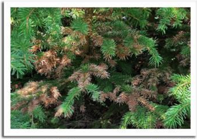
Lirula needlecast on Black Hills spruce

grass growing under and into trees. New needle growth should be protected from infection with treatment of a registered fungicide multiple times in the spring and again in July for at least two years. Prevention is easier; growing spruce on higher ground with enough spacing and weed control to keep the needles dry is a best practice. Even spruce planted in wind rows can develop this disease and grow to look and perform poorly. Spruce trees require air movement around all sides of the tree.