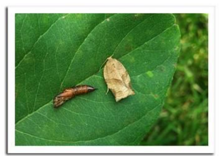
Obliquebanded leafroller moth and pupa

OBLIQUEBANDED LEAFROLLER: Moths of the second flight are appearing in low numbers in pheromone traps. The summer flight is underway and will likely continue until early September this year, in which case surface feeding damage would also persist into fall. OBLR larvae have been prevalent in soybeans and other field crops this season.