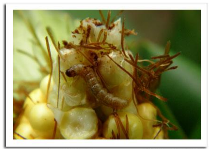
European corn borer third instar larva

Beloit 1,822, La Crosse 1,757, Madison 1,778, and Eau Claire 1,750.