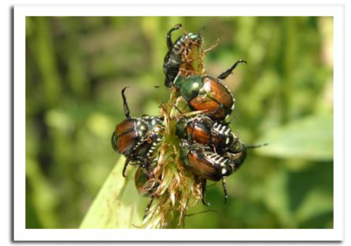
Japanese beetles feeding on corn silks

JAPANESE BEETLE: Silk pruning has become evident along field edges, although at most sites the heaviest feeding is limited to the outer rows and the infestations do not extend more than 5-6 rows into the field interior. Control of this pest in corn is warranted if populations exceed three beetles per ear and pollination is less than 50% complete. Chemical treatment of entire fields is rarely necessary. Border area spot treatments are usually sufficient for reducing beetles during the critical pollination period.