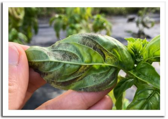
Basil downy mildew

ing in early August. Last year, the first basil downy mildew (BDM) cases of the season were confirmed by mid-July. If basil downy mildew is suspected, harvesting early may be the best option for avoiding total crop loss. Plants that are already showing noticeable BDM symptoms, such as yellowing leaves and gray downy growth on the lower leaf surface, should be immediately removed and disposed of off-site.