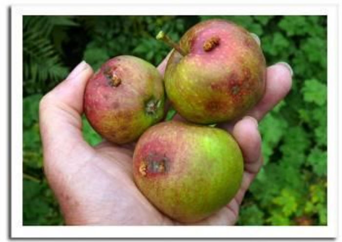
Codling moth larval damage to apples

pressure is often a direct indicator the efficacy of spring generation management programs.