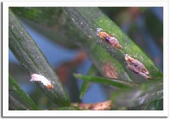
Coniferous Fiorinia scale on hemlock

Similar to Cryptomeria and elongate hemlock scale that were also found on hemlock nursery stock, the Fiorina scale has the potential to damage native Wisconsin evergreens, including firs, pines, spruces, hemlock, junipers (including red cedar), and Canadian yew. Unlike the other armored scales that feed only on needle undersides, Fiorinia feeds on both the upper and lower needle surfaces. Damage from this new scale is likely to include yellowing of needles, needle loss, and reduced tree vigor, which can exacerbate other health issues or predispose plants to secondary pest problems.