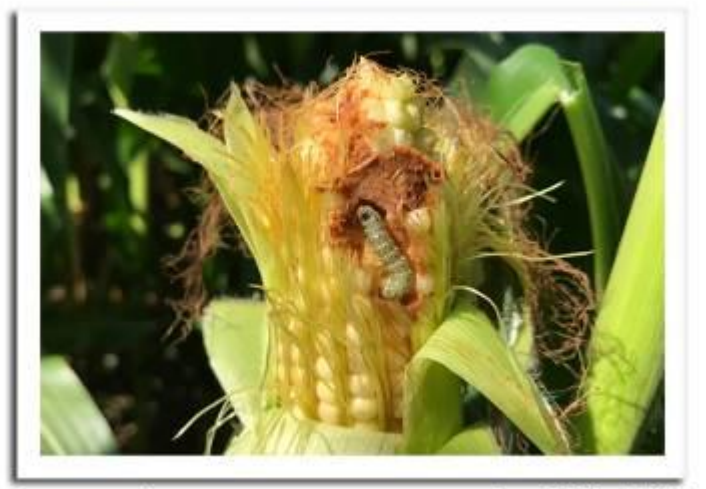
Corn earworm larva

moths for three consecutive nights) signals that sweet corn producers should increase monitoring of fields with green silks.