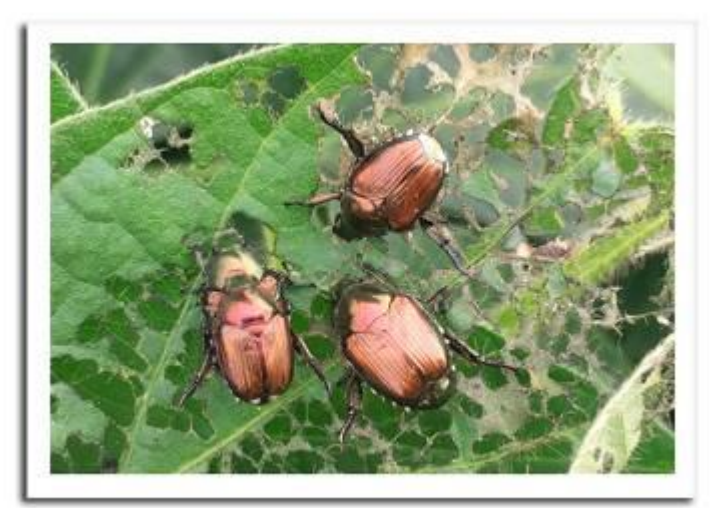
Japanese beetles feeding on soybean leaf

JAPANESE BEETLE: Adult Japanese beetles continue to cause damage to soybean field margins, with the highest counts (100-138 beetles per 100 sweeps) documented in Clark, Crawford, and Lafayette counties in the southwest and north-central districts. Average defoliation rates in fields surveyed since mid-July have varied, but have all been below the 20% threshold for soybeans in the reproductive stages, therefore treatment has generally not been warranted.