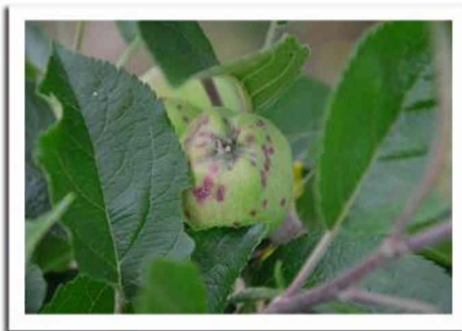
San Jose Scale crawler 'white cap phase'

the tape on younger limbs (2-3 inches in diameter) in blocks with a history of SJS damage is advised. A 10x hand lens is required to view the oval, bright-yellow crawlers. A capture of 10-15 crawlers in a few days, or 10 crawlers on one tape, may warrant control.