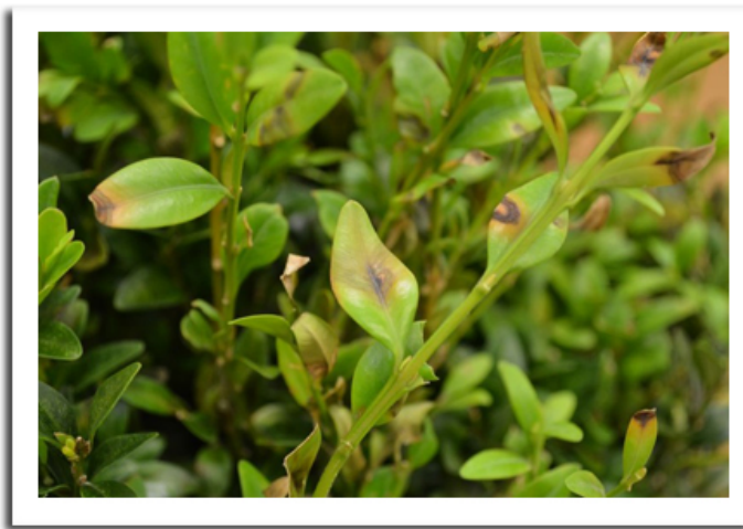
Boxwood blight lesions

BOXWOOD BLIGHT: 'Green Velvet' boxwood stock from an Oregon supplier was found positive for boxwood blight at a Michigan box store chain last week, and DATCP inspectors are currently checking for diseased plants that may have been shipped to Wisconsin retailers. Boxwood blight is a developing problem, with infected plants occurring at numerous locations nationwide, from numerous sources. Retailers and homeowners are encouraged to check their boxwood plants for symptoms, and symptomatic plants should be sampled and tested at the UW Plant Disease Diagnostic Lab. More information about boxwood blight, its symptoms, and testing can be found at https://datcp.wi.gov/Pages/Programs_Services/BoxwoodBlight.aspx .