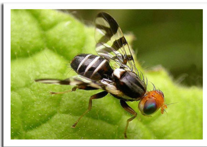
Apple maggot fly

month. This annual event corresponds with the accumulation of 900 degree days (modified base 50°F) when soil moisture is appropriate. Apple maggot traps should be placed next week in perimeter trees adjacent to abandoned orchards or woodlots to capture the earliest flies.