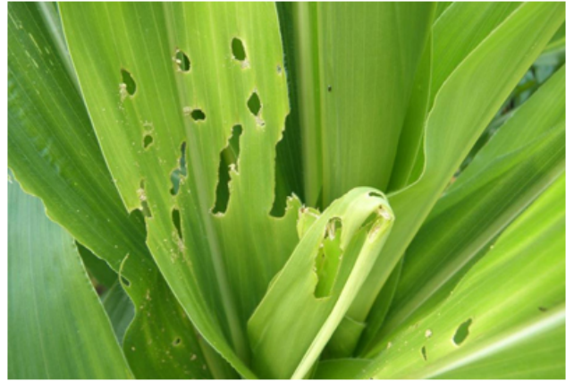
Stalk borer damage to corn

ed by late June and spot treatment may be justified for severe infestations. Close inspection of fields is recommended through the V7 stage since Bt corn hybrids suppress but will not completely control stalk borers.