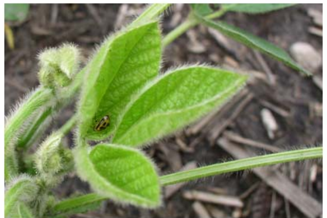
Bean leaf beetle in soybean trifoliolate

BEAN LEAF BEETLE: Light defoliation was observed in 30% of sites surveyed in the southern two-thirds of the state. Despite widespread feeding injury, less than 5% of soybean plants were affected in the infested fields and very few beetles were found. Treatment specifically for this pest is seldom justifiable, but could be considered in the rare event that defoliation exceeds 40% or for populations of 39 or more beetles per foot of row during the vegetative stages.