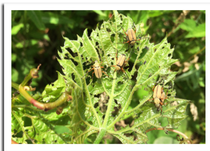
Rose chafer beetles feeding on wild grape

ROSE CHAFER: This generalist pest is appearing in vineyards and orchards. Scouting twice weekly is advised for sites on sandy soils and those with a history of rose chafer problems once the first beetle is observed. An average of two beetles per vine has been suggested as the basis for initiating controls, although the feeding period is usually brief (<3 weeks) and the beetles usually disappear by July without causing permanent damage. Commercially available traps can attract beetles from surrounding areas and are not recommended for use in vineyards.