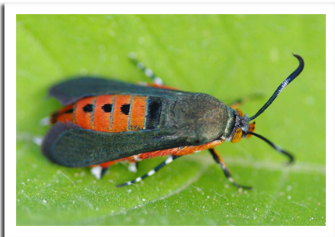
Squash vine borer moth

SQUASH VINE BORER: Moth emergence is expected to begin next week in warm southern Wisconsin locations. Close inspection of pumpkins, squash, gourds, and other vine crops for eggs and evidence of larval boring should start once 900 degree days (simple base 50°F) have been reached. If insecticide use is warranted for SVB control, materials must be applied before the larvae bore into vines and become protected by vine tissue. Applying treatments while runners are shorter than two feet long is most critical.