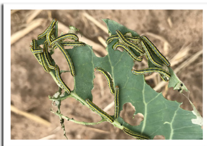
Zebra caterpillars on cauliflower

ZEBRA CATERPILLAR: This infrequent pest, named for its prominent black and yellow longitudinal stripes, was defoliating cauliflower leaves at a St. Croix County CSA on June 18. Larvae feed during the day on the foliage of a variety of broadleaf crops and ornamentals, causing ragged leaves. The young caterpillars initially feed together in groups, but later separate and feed individually. The zebra caterpillar occurs sporadically in Wisconsin and is generally not considered a serious pest. Manual removal of the larvae is the preferred form of control.