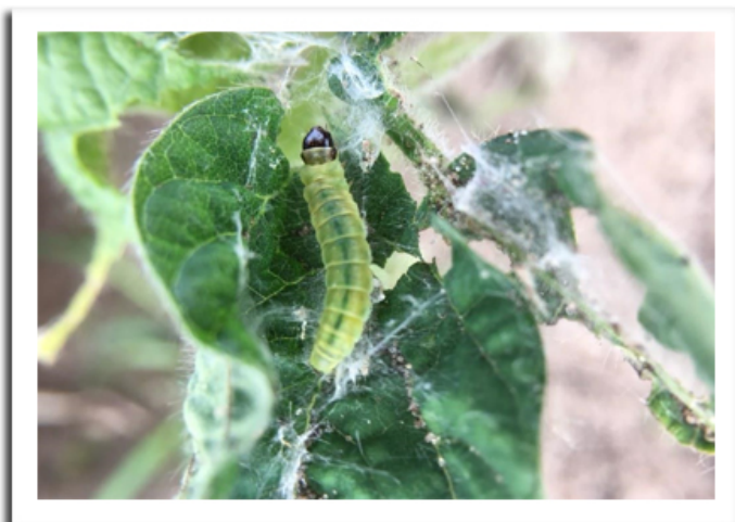
Obliquebanded leafroller larva

of the state. The small, newly-hatched caterpillars are controlled by most products applied for codling moth (except granulosis virus and mating disruption), but scouting is still required to determine if codling moth sprays have effectively reduced OBLR populations or if additional measures are needed to prevent fruit damage. Sampling for fruit and foliar feeding should begin about a week after the first moths are captured in pheromone traps.