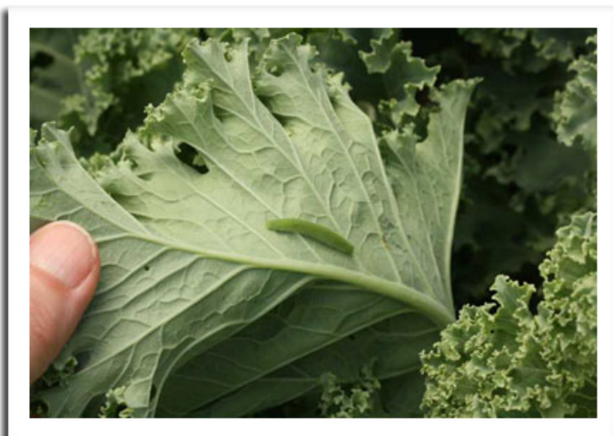
Imported cabbageworm larva

IMPORTED CABBAGEWORM: Damage caused by larger cabbageworms has become very conspicuous, making the velvety green caterpillars generally easy to find and remove from gardens and smaller plantings. For larger commercial cabbage crops where chemical control may be required, ICW populations should be assessed weekly by examining 25-50 randomly-selected plants (depending on field size) and recording the number of infested plants.