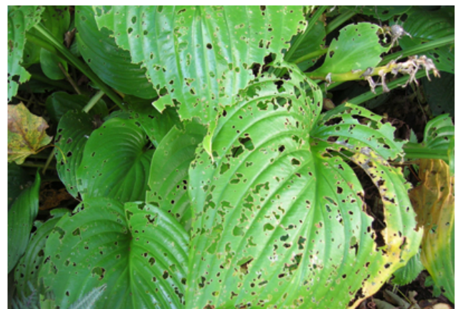
Slug damage on hosta

SLUGS: Persistent wet conditions are providing favorable conditions for slug activity and damage in some areas of the state. Because slugs are nocturnal feeders, plant damage appears overnight and the cause is usually not apparent. Species such as the grey field slug, Deroceras reticulatum , are capable of inflicting substantial crop and garden damage, traveling up to 40 feet in one night. Slug activity quickly subsides with drier weather, but if control is warranted, a few options are as follows: sprinkling diatomaceous earth atop the soil beneath high-risk plants; encircling containers and small raised beds with protective copper tape; or trapping slugs by placing wet newspapers beneath boards laid on the ground. Slug baits with an iron phosphate component are often a good solution in mulched perennial beds.