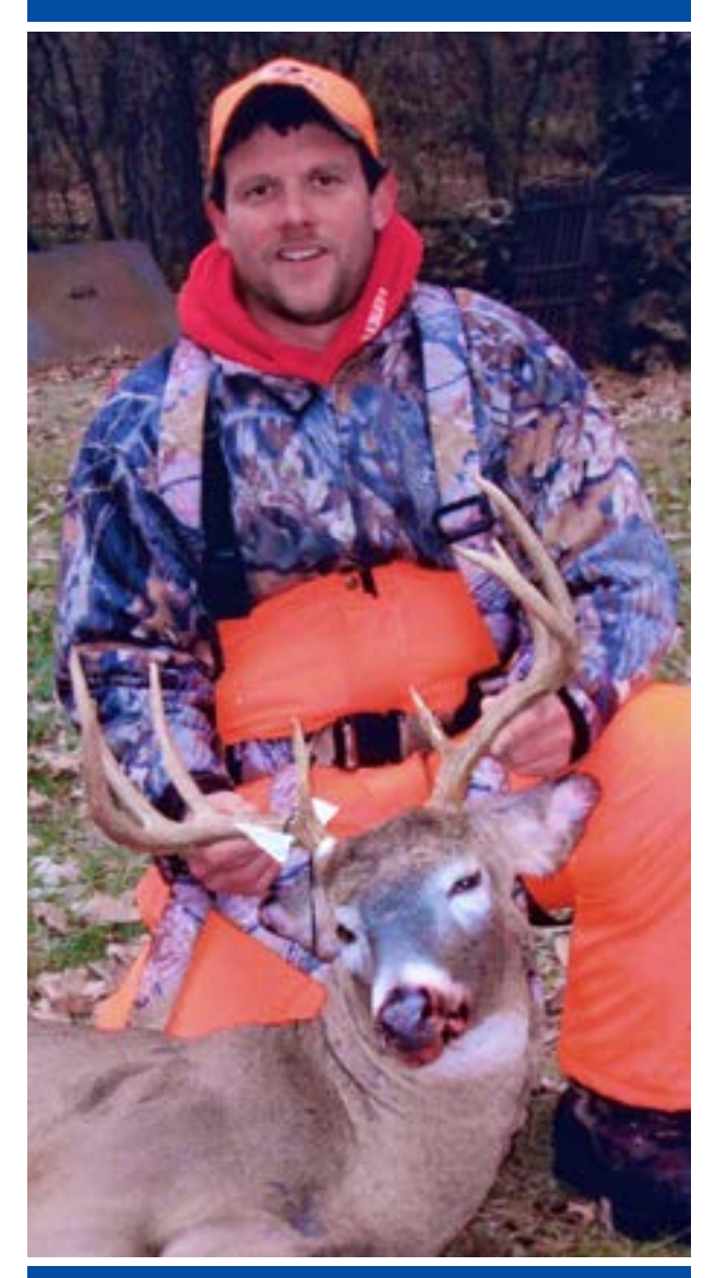
Keep Your Harvest Fresh and Wholesome

Wisconsin Department of Agriculture, Trade & Consumer Protection