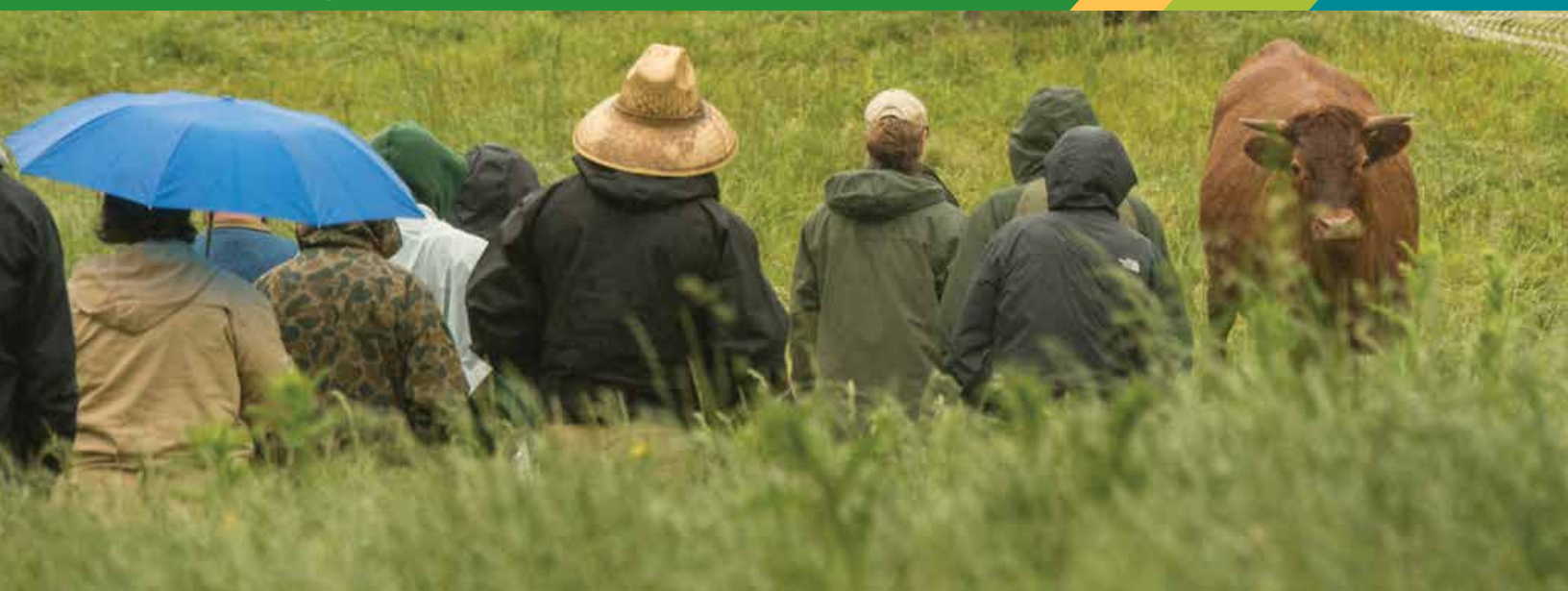
Lance Cheung, USDA