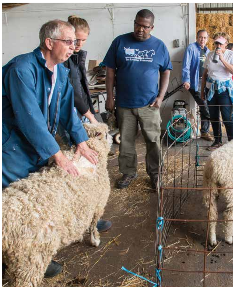
Lance Cheung, USDA