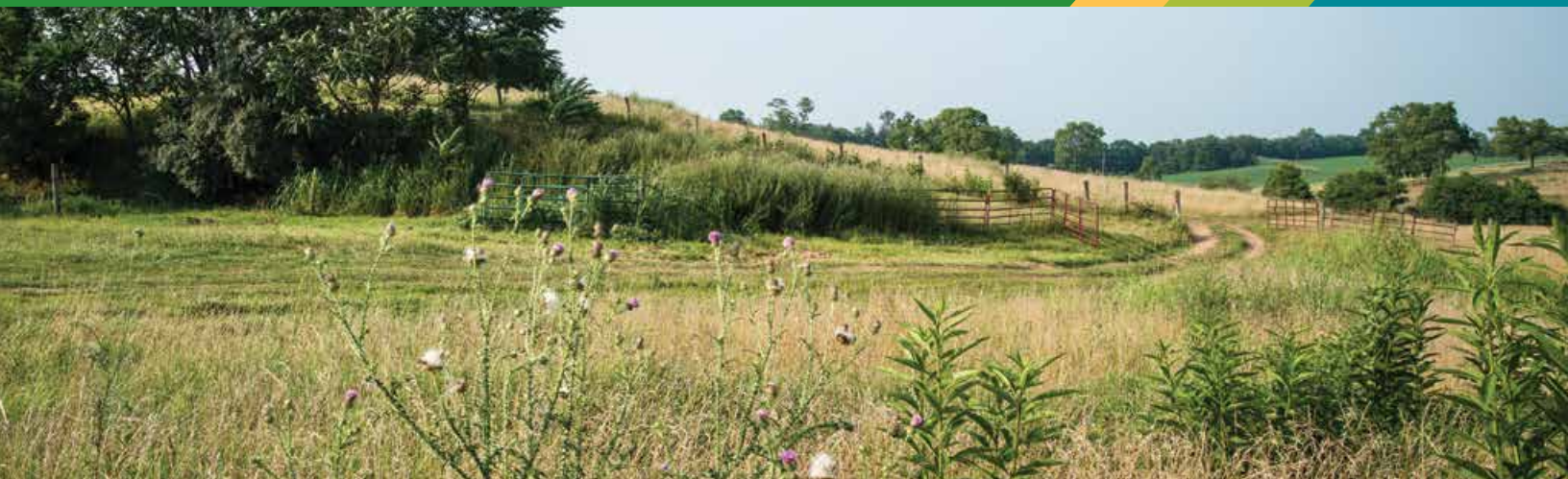
Lance Cheung, USDA

Use this sample checklist to stay organized as you make arrangements for your field day. A Word document version of this checklist is available at www.sare.org/farmer-to-farmer/tools .