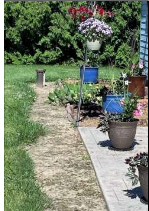
A homeowner's use of pesticides near a well can increase the potential for well contamination.

BLS performed all groundwater analytical testing using GC/MS/MS and LC/MS/MS in accordance with ISO 17025 accreditation standards. All samples were tested for 107 pesticides and nitrate. A full listing of compounds analyzed is included in Appendix A along with established and proposed Preventive Action Limits (PALs) and Enforcement Standards (ESs) for each compound (ch. NR 140, Wis. Adm. Code).