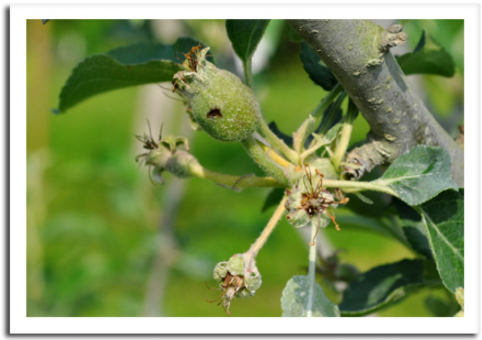
Plum curculio crescent-shaped oviposition scar

PLUM CURCULIO: Overwintered weevils are likely to begin migrating into orchards next week as temperatures moderate. Early blooming varieties such as 'Gala', 'McIntosh' or 'Paulared' should be checked for evidence of feeding and oviposition during the first 14 days after petal fall.