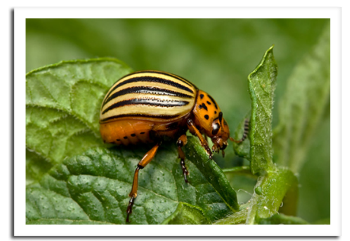
Colorado potato beetle

COLORADO POTATO BEETLE: Overwintered adults will soon begin emerging from hibernation and dispersing to plants near field edges. The early colonizing population is seldom damaging to young potatoes protected with a systemic neonicotinoid, but monitoring beetle abundance is advised to ensure effectiveness of insecticide products. Egg deposition and larval hatch can be expected by the third week of May. The orange-yellow eggs are deposited in clusters of 15-30 on the undersides of leaves.