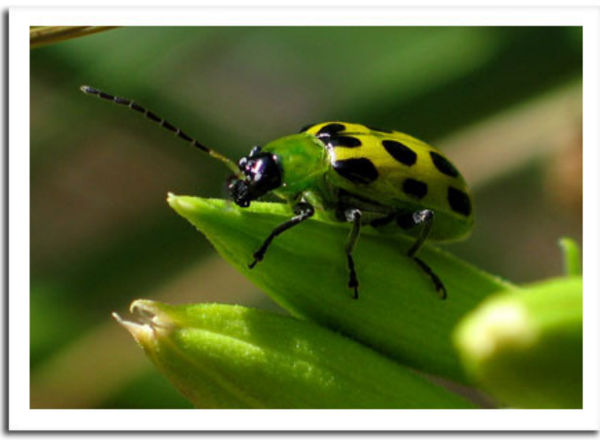
Spotted cucumber beetle

SPOTTED CUCUMBER BEETLE: Spring migrants were collected from Iowa County alfalfa earlier this week. These distinctive yellowish-green beetles with black spots do not overwinter in Wisconsin, but arrive at this time of year on storm fronts originating in the southern United States. Both the spotted species and the striped cucumber beetle transmit bacterial wilt of cucumbers, muskmelons and watermelons. Scouting field edges and interiors multiple times per week is recommended starting in late May once the beetles are noticed. Early control of the striped beetle species may be required in large commercial muskmelon or cucumber operations if numbers are high, especially if the beetles have been a problems in the past. Spotted cucumber beetles are rarely abundant enough to require treatment.