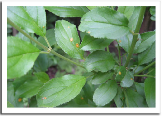
Crown rust on buckthorn

CROWN RUST: Nursery inspectors report that the orange-yellow spots characteristic of this rust disease are appearing on the leaves of common and lanceleaved buckthorn from Kenosha to St. Croix County. Although not particularly damaging to buckthorns, the spots produce spores capable of infecting oats and significantly reducing grain yield. The extent and severity of infection varies from year to year, depending on weather, the amount of rust inoculum present, and the acreage of susceptible varieties. Heavy amounts of rust inoculum on the buckthorn host may indicate greater rust potential for oats this year, should damp conditions suitable for infection continue.