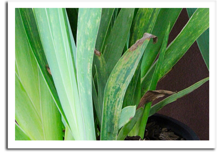
Potyvirus in Iris

Washington counties were diagnosed with this virus. Symptoms are leaf mottling and striping and stunting; severe infection can cause decline or premature plant death. Named after Potato virus Y (the type virus), members of the genus Potyviridae account for approx.imately 30% of currently known plant viruses. More than 200 species of aphids are known to spread these viruses, with transmission also occurring through mechanical inoculation, but not by grafting or contact between plants. Infected plants should be removed and destroyed.