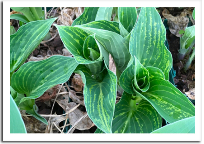
Hosta virus X on 'Blue Cadet' hosta

proper pruning sanitation, and destroying infected plants are the best controls.