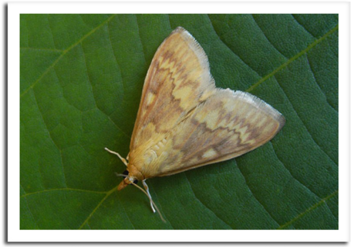
European corn borer moth

EUROPEAN CORN BORER: A few early spring adults could emerge late next week in locations such as Beloit, La Crosse and Spring Green where the 374 degree days (modified base 50°F) required for corn borer flight to begin are likely to be surpassed over the weekend of May 20-21. Black light trappers are advised to carefully examine trap contents during the next two weeks for the first spring moths.