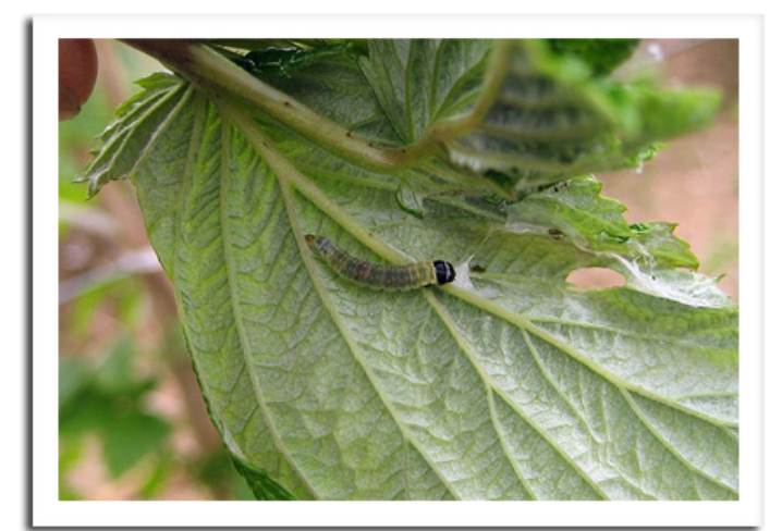
Obliquebanded leafroller larva

OBLIQUEBANDED LEAFROLLER: These yellowish-green larvae with black head capsules are currently feeding on apple blossoms and shoots, and evidence of their activity is detectable with a 10X hand lens. Pheromone traps should be placed soon to detect the first OBLR moths of the 2017 season, expected to appear around fruit set.