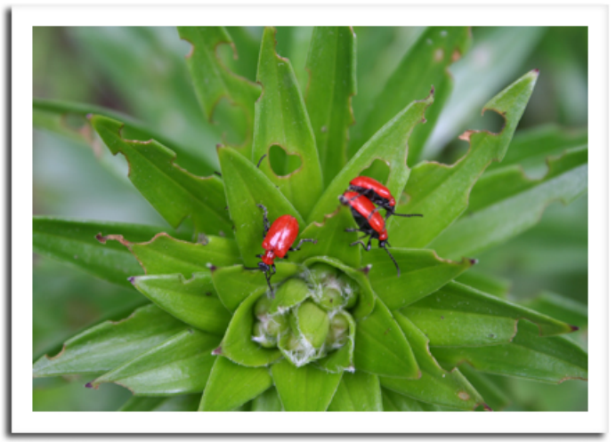
Lily leaf beetles

spreading. sightings should be reported to the DATCP Nursery Program at datcpnursery@wisconsin.gov.