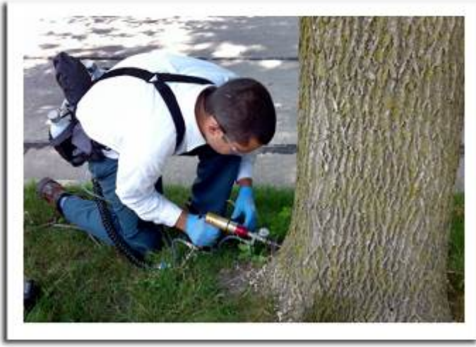
EAB trunk injection treatment

EMERALD ASH BORER: The treatment window to apply soil-drench systemic insecticide products to protect ash trees from emerald ash borer (EAB) is now through mid-May. An early spring insecticide application provides ample time for the product to be moved from roots to other tissues throughout the tree prior to the onset of larval feeding. Homeowner available products must be applied annually and are effective on healthy trees up to 20 inch diameter at breast height (DBH) with less than 30% canopy decline.