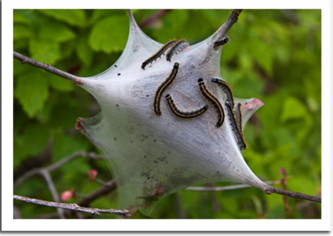
Eastern tent caterpillar

EASTERN TENT CATERPILLAR: Egg hatch began by March 26 in Grant, Iowa and Rock counties following the accumulation of 50 degree days (modified base 50°F). The characteristic tents are now becoming visible on wild cherry, apple, flowering crabapple and other host trees. Control is most effective from late April until early May, while the larvae and tents are still small.