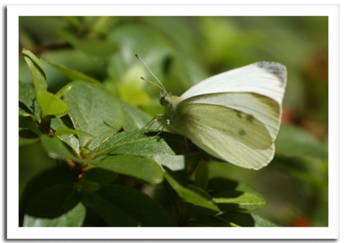
Imported cabbageworm butterfly

IMPORTED CABBAGEWORM: Adults have been active since late March. The presence of these yellowish-white butterflies around field plantings and home gardens signals eggs are being laid on early-planted broccoli, cabbage, kale and other cole crops. Btk products for ICW control must be applied while larvae are small.