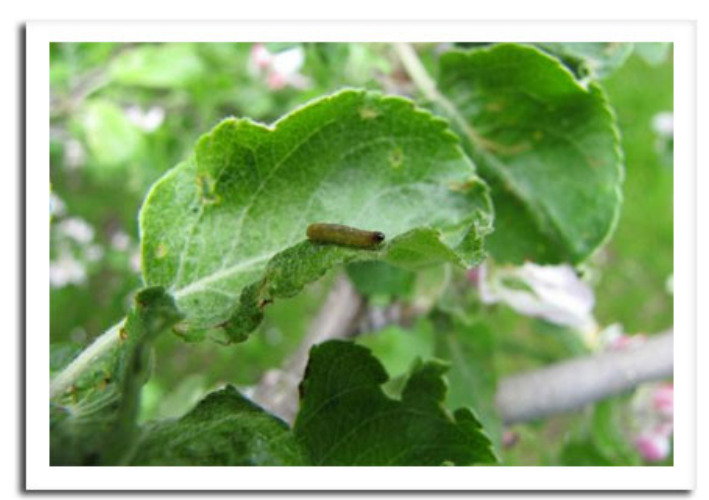
Obliquebanded leafroller larva

OBLIQUEBANDED LEAFROLLER: Larvae have resumed activity after overwintering under the bark of scaffold limbs and twigs. The ¼-inch, yellowish-green caterpillars with black head capsules are expected to feed for 2-3 weeks before pupating within leaf tubes. Scouting flowers and leaf buds with a 10X hand lens is recommended at this time.