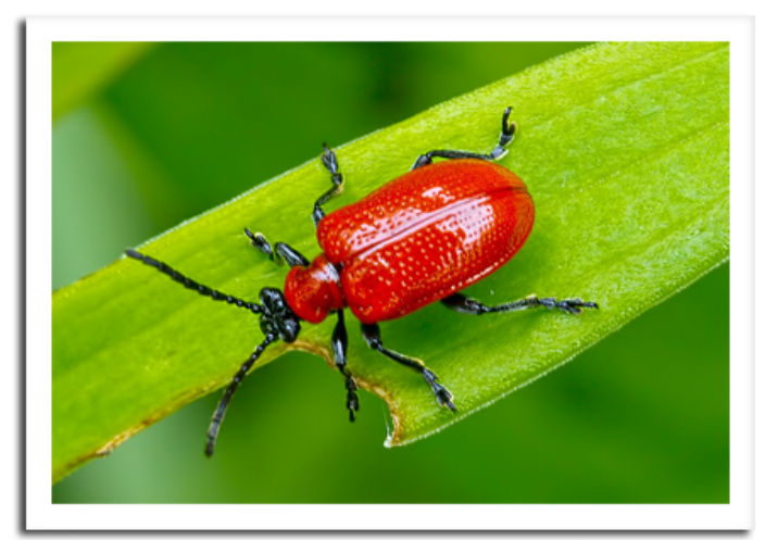
Lily leaf beetle

may still be possible with diligence on the part of local communities. Gardeners, nursery growers and residents are encouraged to closely inspect lily plants for the bright red beetles and larvae and report any finds to the DATCP Nursery Program at datcpnursery@wisconsin.gov.