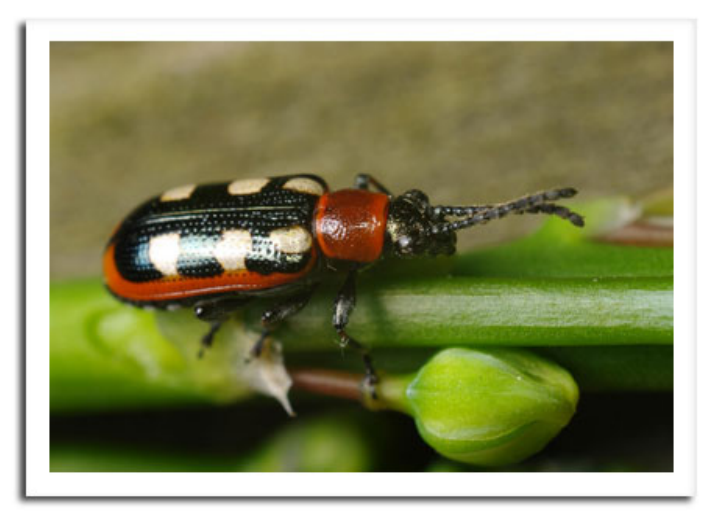
Common asparagus beetle

COMMON ASPARAGUS BEETLE: The phenology model for this asparagus pest forecasts the first appearance of adults and the start of egg deposition on asparagus spears from 150-240 degree days (simple base 50°F). The lower range of this threshold will be exceeded during the first week of May near Beloit, La Crosse, Madison, Platteville, and other advanced southern and western locations.