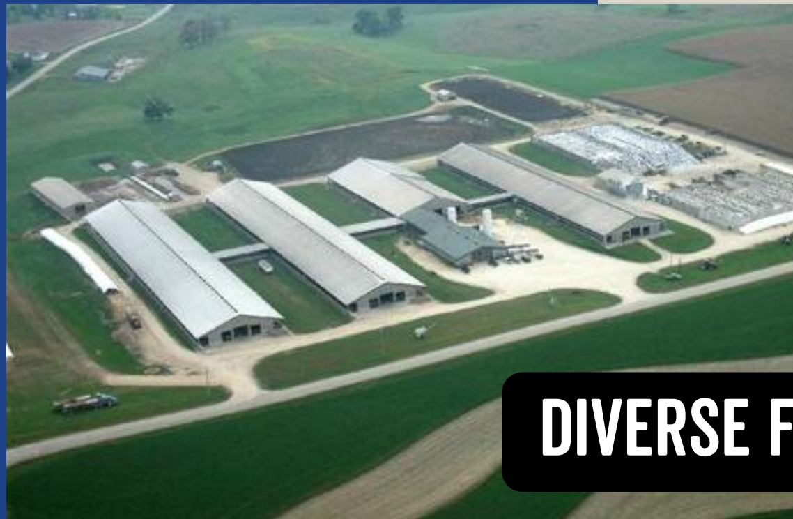
DIVERSE FARM SIZES