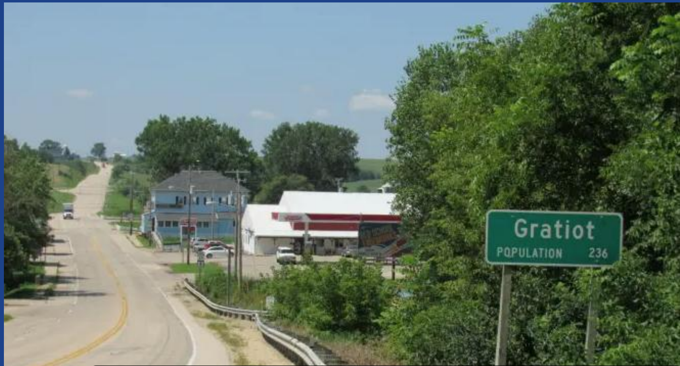
VERY RURAL & SMALL TAX BASE