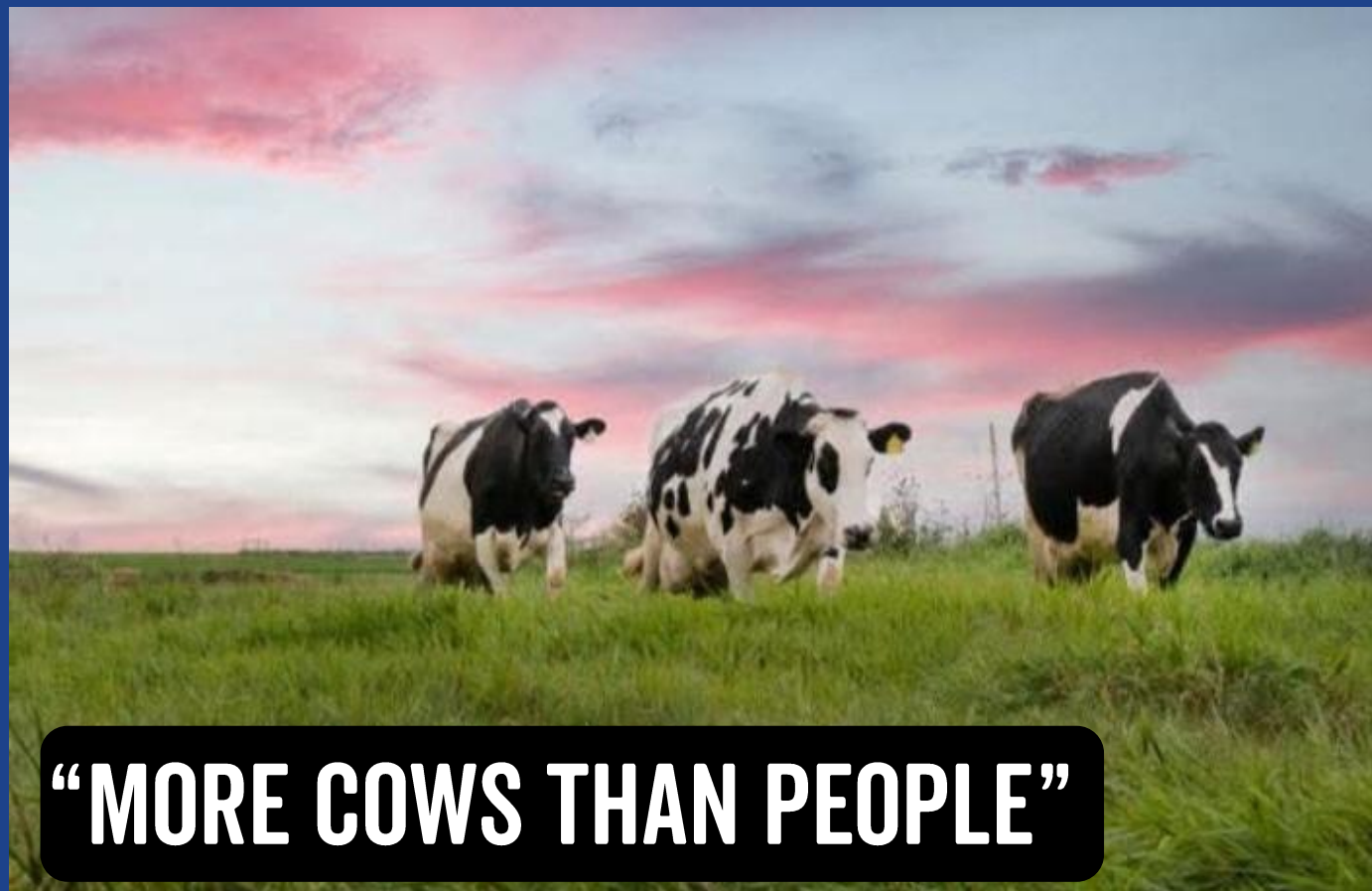
“MORE COWS THAN PEOPLE”