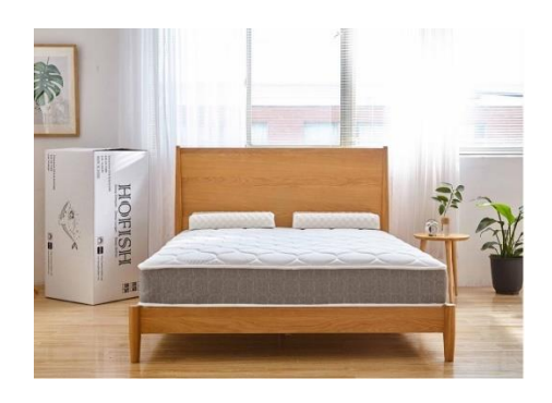
HOFISH Recalls Mattresses Due to Violation of Federal Flammability Standard; Sold Exclusively on Amazon.com | CPSC.gov