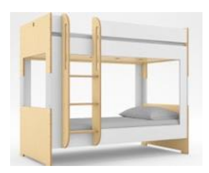
Casa Kids Recalls for Repair Cabina Bunk Beds Due to Fall Hazard (Recall Alert) | CPSC.gov

What to do: Consumers should immediately stop using their recalled Cabina Bunk Beds until they have inspected their beds to determine whether the screws that hold the bed's foundation to the guardrails are tightly in place. Casa Kids is contacting all purchasers directly with detailed instructions on how to inspect and repair their bunk beds. Casa Kids will immediately send a new set of screws to any consumers who alert Casa Kids that their bed's quardrails are not tightly in place. Consumers can contact Casa Kids collect at 718-694-0272 from 9 a.m. to 5 p.m. ET Monday through Friday, email at casa@casakids.com, or online at www.casakids.com/pages/productrecall for instructions on how to inspect and repair the bunk bed, or at www.casakids.com and click on "Product Recall." located in the page's footer in the "Additional Information" column for more information.