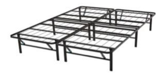
Global Home Imports Recalls Platform Bed Frames Due to Serious Injury Hazard | CPSC.gov

What to do: Consumers should immediately stop using the recalled HR Platform Frames and contact Global Home Imports to receive a free repair kit with metal clips to strengthen the frame. Global Home Imports will ship a kit directly to consumers free of charge. Consumers can contact Global Home Imports toll-free at 888-550-4371 from 8 a.m. to 4 p.m. MT Monday through Friday, email at <a href="recall@bedtech.com">recall@bedtech.com</a> or online at <a href="www.bedtech.com">www.bedtech.com</a>/hr-platform-recall.