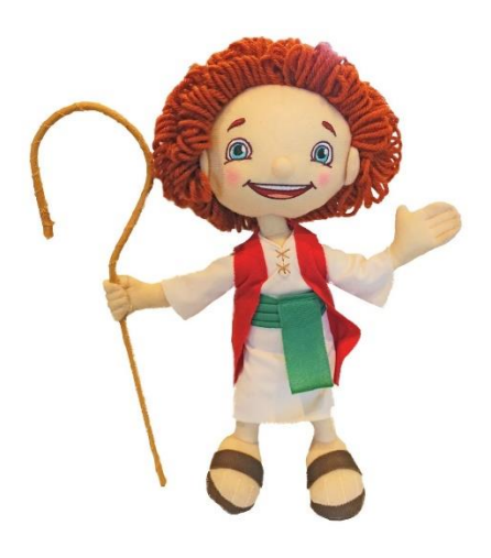
Parker Squared Recalls Shepherd Boy Plush Toys with Wire Shepherd's Staff Due to Laceration Hazard (Recall Alert) | CPSC.gov

What to do: Consumers should immediately discard the toy's wire staff and contact The Shepherd's Treasure for a full refund of the value of the Shepherd Boy Plush Toy in the form of a gift certificate. Consumers can continue to use the plush toy without the shepherd's staff. The Shepherd's Treasure is contacting all purchasers directly. Consumers can contact The Shepherd's Treasure toll-free at 844-310-2229 from 9 a.m. to 5 p.m. CT Monday through Friday, by email at <a href="recall@theshepherdstreasure.com">recall@theshepherdstreasure.com</a>, or online at <a href="TheShepherdsTreasure.com">TheShepherdsTreasure.com</a> and click on "Recall" for more information.