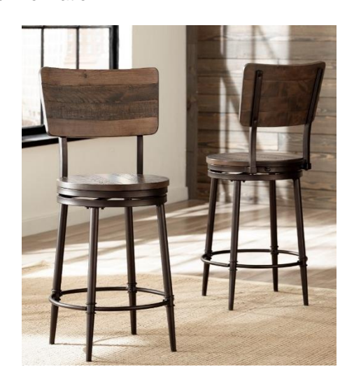
Hillsdale Furniture Recalls Jennings Counter and Bar Stools Due to Fall Hazard | CPSC.gov

What to do: Consumers should immediately stop using the recalled Jennings counter and bar stools and contact Hillsdale Furniture for a free repair kit. Consumers can contact Hillsdale Furniture at 800-832-1777 from 9 a.m. to 5 p.m. ET Monday through Friday, email at <a href="mailto:recall@hillsdalefurniture.com">recall@hillsdalefurniture.com</a>, or online <a href="mailto:https://hillsdalefurniture.com">https://hillsdalefurniture.com</a> and click on "Product Recalls" located at the bottom of the page for more information.