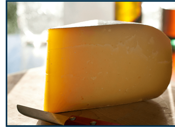
Pleasant Ridge Reserve, made by Uplands Cheese, is the most-awarded cheese in American history.

Learn more about this project on YouTube: https://youtu.be/w4Vf4P8pzdE?si=gV1IEZNxbSwgpQ-D