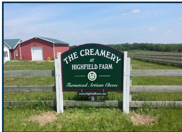
Highfield Farm Creamery located in Walworth, Wisconsin.

Learn more about this project on YouTube: https://youtu.be/lv4rySeqjJg?si=p710Q45TiL9NxctF