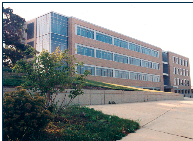
Department of Agriculture, Trade and Consumer Protection building in Madison, Wisconsin.

While the State of Wisconsin has continually operated the DPG since fiscal year (FY) 2014, additional DATCP Division of Agricultural Development (DAD) Grant programs predated the advent of the DPG as it is currently named and operated. During these prior iterations, DAD grants supported dairy processing operation projects, as well as produce operations, meat production, and other food processing projects. Before the 2014 inception of the DPG, forerunner grant programs were offered in 2008 and 2009.