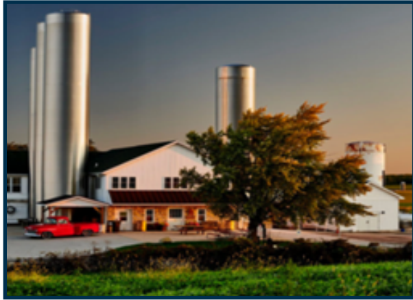
Decatur Dairy located in Brodhead, Wisconsin.

Learn more about this project on YouTube: https://youtu.be/hbt3A9wm7CY?si=l4HGDJc-NoJUg3On