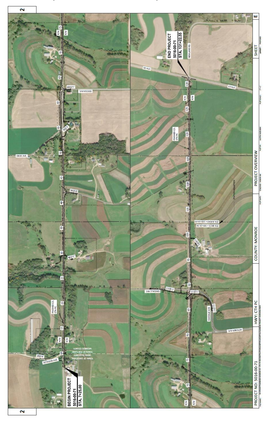
Figure 1a: The proposed start, end locations for the reconstruction of County Highway (CTH) PC in Monroe County, WI (Jewell, 2023). Note , the project overview depicted in Figure 1a portrays a stacked map- the right half of the map sheet portrays the project corridor traveling northerly from the end point on the top of the left half of the map sheet.