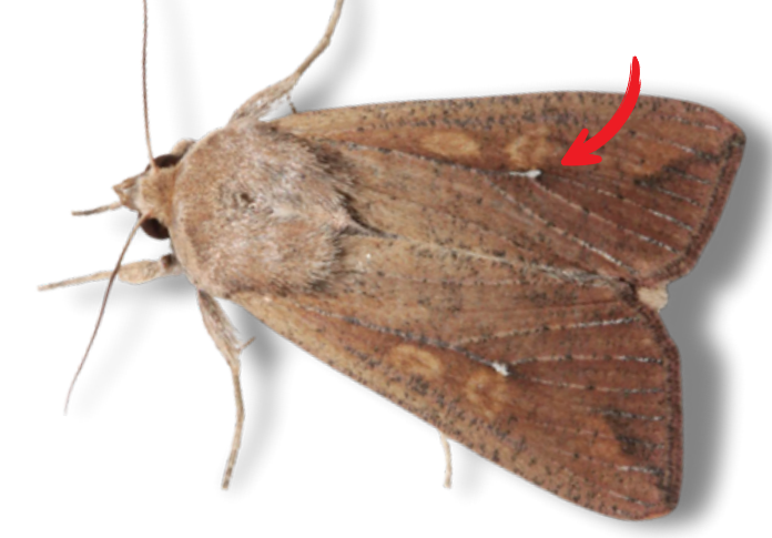
True armyworm moth

Reporting: Set traps on March 26. Change the trap lure and red Vaportape strip monthly, on April 30, June 4, and July 2. Please report weekly moth counts by 11 a.m. each Wednesday using the Insect Trap Networks Survey123 app. Counts are posted online by 4:30 p.m. on Thursdays.