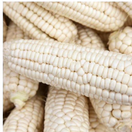
Figure 1. White Corn

From that meeting, 10 families wanted to experiment with the ancestral practice of growing corn communally. Laura spoke with Oneida Nation and was able to lease nine acres of farmland. She and her husband, Robin, purchased basic farm equipment from auctions. They traded wild rice for corn seed with Onondaga Nation in New York. Having access to land, equipment, and seeds, the families were able to plant their first field just two months after their first meeting in 2016. They fundraised money and received grant funds to participate in research growing trials. True to their soil health roots, the research trials focused on using fish emulsion for nutrient applications. The fish emulsion added necessary nutrients to the degraded farmland and imitated the ancient practice of burying fish scraps in three sisters mounds of corn, beans, and squash.