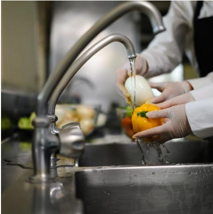
Figure 3. Washing Produce

There are many formulations of bleach in the marketplace, but not all are intended for sanitizing. Understanding what you are trying to accomplish and how to read a sanitizer label are important elements of ensuring that your produce is safe. In this article, we'll explore the difference between chlorine-based bleaches and chlorine sanitizers and provide some broader considerations for use of chemical sanitizers in your operations.