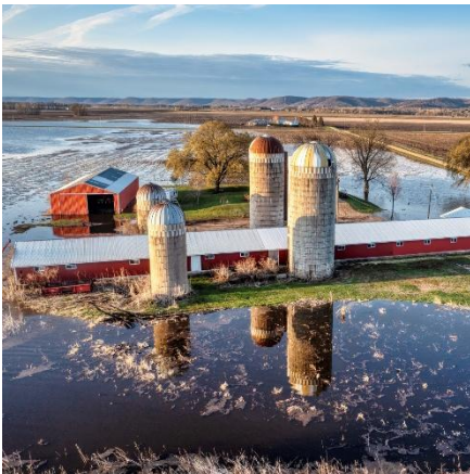
Figure 4. Field Flooding

Flooding is becoming a more frequent issue for farmers in Wisconsin. The U.S. Department of Agriculture (USDA) Forest Service has found that a majority of Wisconsin is at least moderately vulnerable to increased flood flows due to landform characteristics. For produce farmers in particular, this means that preparing and having a plan to respond to flooding are necessary to help mitigate the risks to your crop and public health.