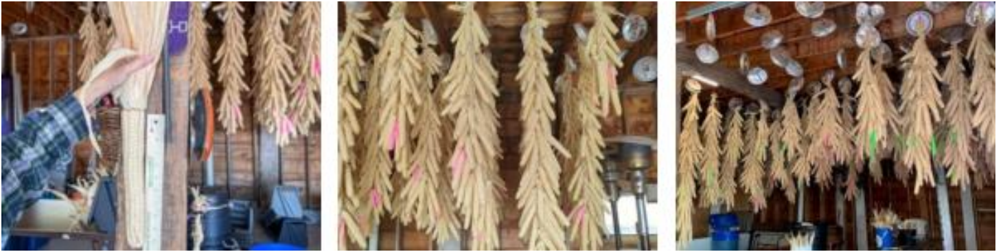
Figure 2. Oneida White Corn

to eat, and one third for seeds for the future. Most importantly, growing together builds community, a space for sharing traditional teachings and language, and creates space for intergenerational learning and relationships. As Lea and Laura’s Oneida elders say, “You can tell the health of a community based on the health of the corn field.”