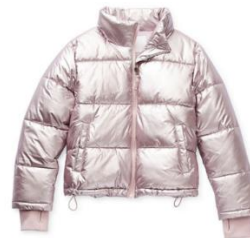
JCPenney Recalls Girls Puffer Jackets Due to Entanglement Hazard | CPSC.gov

What to do: Consumers should immediately take the recalled jacket away from children, cut and remove the drawstring to eliminate the hazard, or contact JCPenney for instructions on how to return the jacket and obtain a full refund of the original purchase price, shipping included. Consumers can contact JCPenney at 800-322-1189 from 7 a.m. to 9 p.m. CT Monday through Sunday or online at www.jcpenney.com and click on "Customer Service" then "Recalls" for more information.