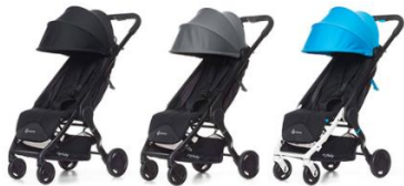
Ergobaby Recalls METROUS Strollers Due to Choking Hazard | CPSC.gov

What to do: Consumers should immediately stop using the recalled strollers and contact Ergobaby for instructions and a full free replacement restraint harness with buckle. Consumers can contact Ergobaby toll-free at 888-416-4888 from 9 a.m. to 5 p.m. PT Monday through Friday, email at Support@Ergobaby.com , or online at www.ergobaby.com and click on "Safety Notifications" at the bottom of the page for more information.