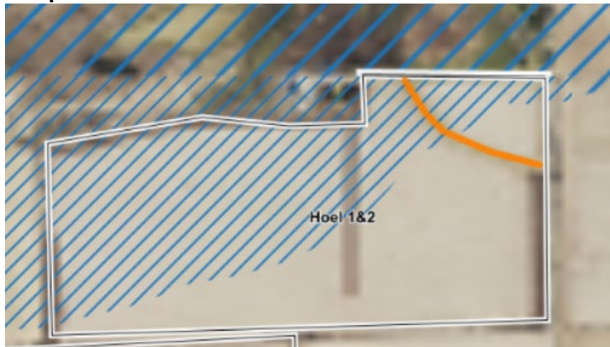
Map of where SWQMA falls within field