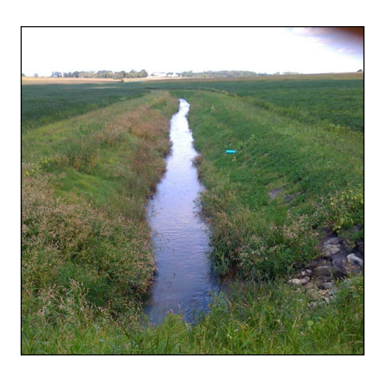
Agricultural drainage lowers the water table to make land more suitable for farming,