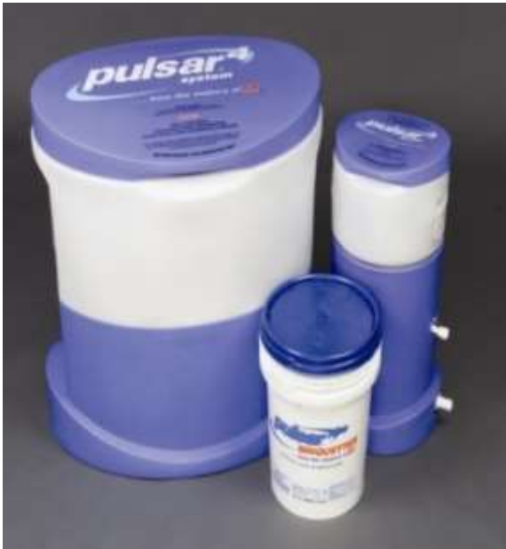
Figure 3a. Each feeder has a specific chemical(s) that can be used