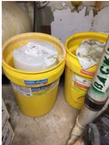
Figure 2, example of containment