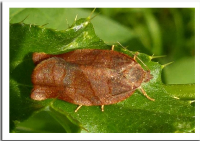
Obliquebanded leafroller moth

OBLIQUEBANDED LEAFROLLER: Moths of the second flight are appearing in pheromone traps statewide, from Burlington to Bayfield. The summer flight is underway and will likely continue until early September this year, in which case surface feeding damage would also persist into fall. OBLR larvae have been unusually abundant and widespread in soybeans and other field crops for the second year in a row.