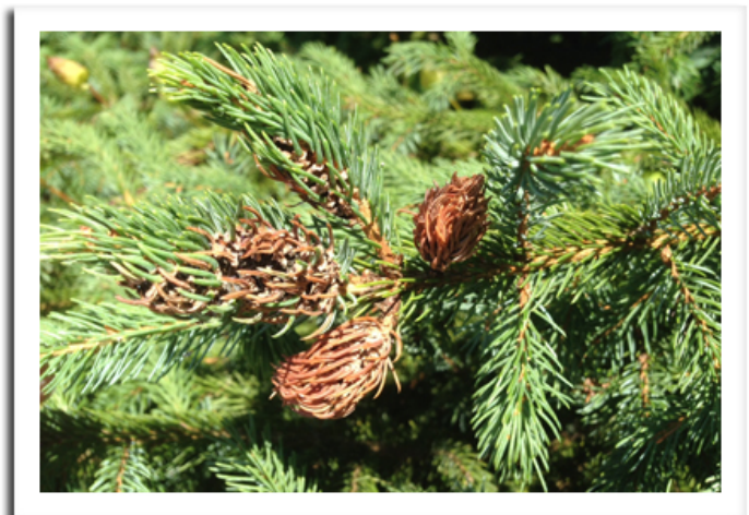
Pine leaf adelgid

PINE LEAF ADELGID: The cone-shaped galls, which form when needles are injured by adelgid feeding were observed in late July on black spruce trees in Chippewa County. This adelgid species alternates between black spruce and eastern white pine in Wisconsin. At this time of year empty galls are evident on black spruce, while the nymphs have migrated to eastern white pine to feed on the newer shoots. Damage to white pines can be significant and repeated attacks on white pine may cause mortality in low-vigor trees. High value white pine plantings adjacent to black spruce areas should be inspected to determine if control is warranted. Drooping or weeping pine shoots are an indicator of adelgid infestation.