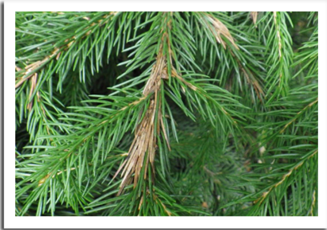
Spruce needle miner

SPRUCE NEEDLE MINER: The clusters of brown needles held together by webbing observed on Black Hills spruce in Pierce County were caused by this spruce pest. Spruce needle miner (SNM) larvae enter and hollow out needles that are at least one year old, then spin silk nests in early summer. The larvae tend to aggregate and feed gregariously. The partially grown larvae overwinter in the nests and pupate the following spring. Controls, if necessary, should be applied in early spring.