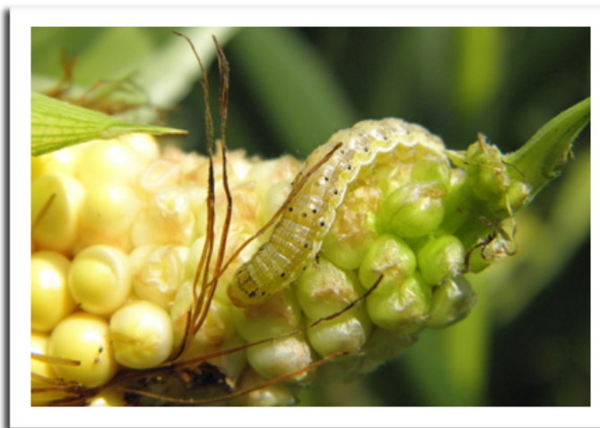
Corn earworm larva

registered at 17 pheromone trap sites, compared to 11 moths captured the previous week. Despite these low numbers, the appearance of even a few moths in traps signals that sweet corn producers should continue to monitor fields with green silks. Small larvae were observed this week in corn ears in a field near Cataract in Monroe County.