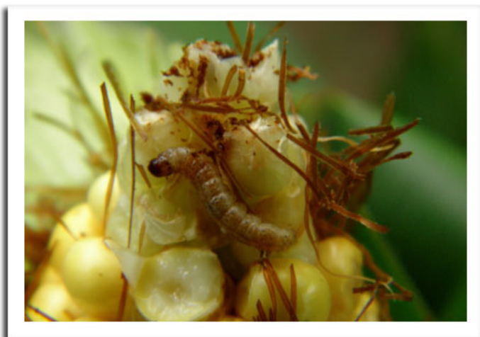
European corn borer third instar larva

EUROPEAN CORN BORER: Larvae are appearing in the ear tips of corn. A few surveyed fields in the southwestern and west-central counties had 1-10% of the ears infested with one or two small caterpillars ranging in development from newly hatched to second-instar. The treatment window for second-generation corn borers will remain open for another 1-2 weeks across the southern half of the state. Controls directed against the summer larvae must be applied during the period after egg hatch and before larvae bore into the stalks, prior to the accumulation of 2,100 degree days (modified base 50°F). Degree day totals as of August 3 were: Beloit 2,006, La Crosse 2,054, Madison 1,884 and Hancock 1,763.