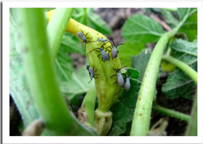
Squash bug nymphs

sides of leaves for the metallic bronze eggs, deposited in groups of 15-40 between leaf veins or on stems, as long as small nymphs are present. Squash bugs are capable of damaging mature fruit, thus control may be needed as the crop nears harvest. OMRI-listed materials include PyGanic, insecticidal soaps and certain oils.