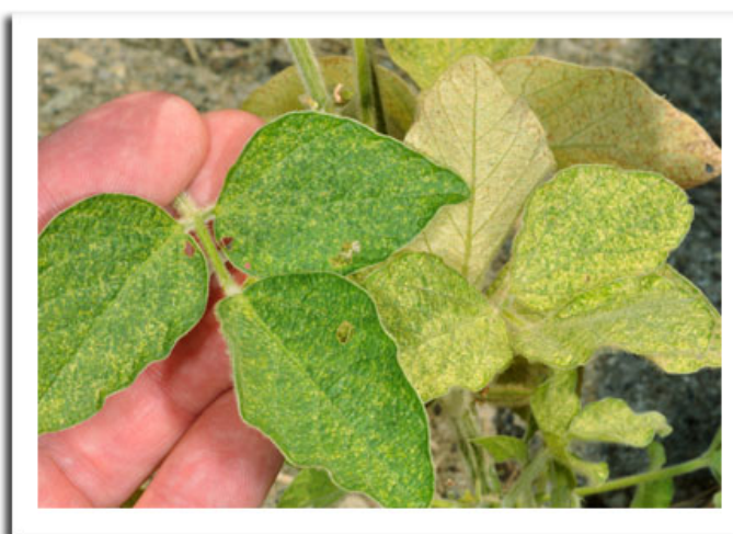
Soybean leaf stippling caused by spider mites

leaves indicative of active mite populations, especially where soils are dry and measurable rainfall is not expected. Since most pyrethroid products that control Japanese beetles also eliminate beneficial insects and can cause mite levels to surge, soybeans should not be treated for Japanese beetle unless the defoliation threshold of 20% is exceeded. Fields recently treated for aphids or Japanese beetle will require scouting in August for mite flare-ups. No economic threshold has been developed for two-spotted spider mite on soybeans in Wisconsin, but a field may qualify for treatment if 10-15% of leaves show stippling or discoloration and mite infestation has been confirmed.