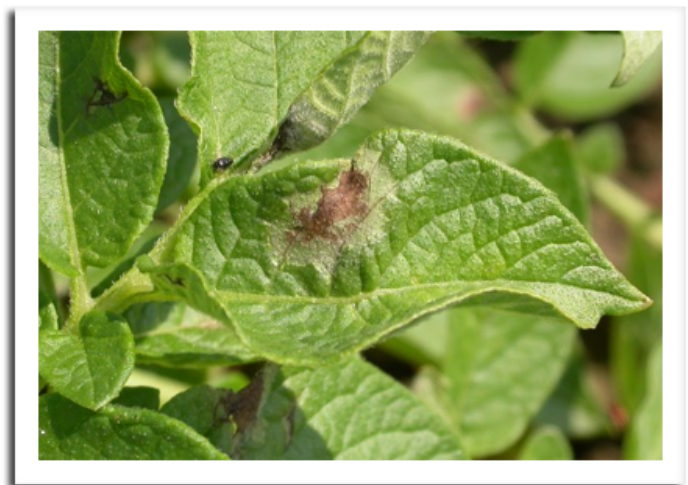
Late blight on potato