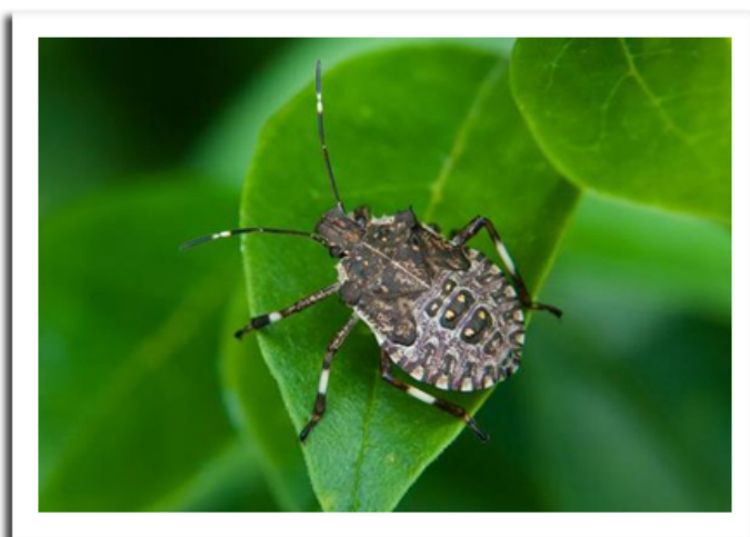
Brown marmorated stink bug nymph

BROWN MARMORATED STINK BUG: Nymphs were captured in a trap at the Allen Centennial Garden on the UW-Madison campus pheromone trap last week, marking the first official capture of BMSB in a pheromone trap in Wisconsin. Fifty additional traps in 12 counties have not yielded any additional specimens to date. The trapping of juvenile BMSBs is evidence of established, reproducing populations in Dane County and indicates fruit growers should increase scouting for BMSB in August.