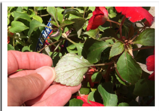
Impatiens downy mildew

Commercial growers of impatiens are advised to inspect and cull plants with light green stippled leaves, curled leaves, or the characteristic white, downy mycelia growth on the undersides of foliage. Home gardeners should also carefully examine impatiens for IDM symptoms before purchasing flowers, and consider planting the mildew-resistant New Guinea impatiens or a New Guinea hybrid to avoid losing plants to IDM.