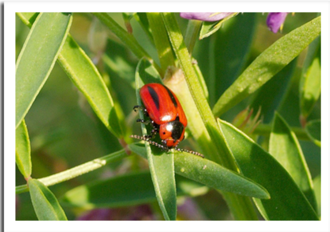
Red turnip beetle

RED TURNIP BEETLE: This red and black beetle was noted in Adams, Monroe and Wood County alfalfa fields on June 22. Red turnip beetle is an occasional pest in the Central Sands area of the state. Hosts include broccoli, cabbage, kohlrabi, radish and turnip, but hoary alyssum and yellow rocket are thought to be the primary food plants. Reports of damage to home gardens are infrequent, except in high population years.