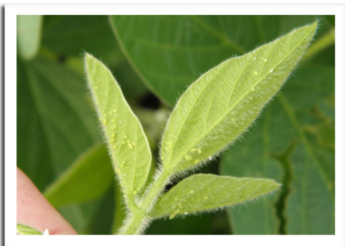
Soybean aphids on new growth

SOYBEAN APHID: Counts remain extremely low in most soybean fields. Of the 36 sites surveyed from June 16-22, nine had averages below two aphids per plant and 75% of the fields had no detectable aphid population. Routine monitoring for aphids should begin by early July.