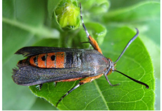
Squash vine borer adult

bases as a weekly spray during the three- or four-week egg laying period can provide protection if the sprays thoroughly cover the plant stems and are applied repeatedly to assure good control.