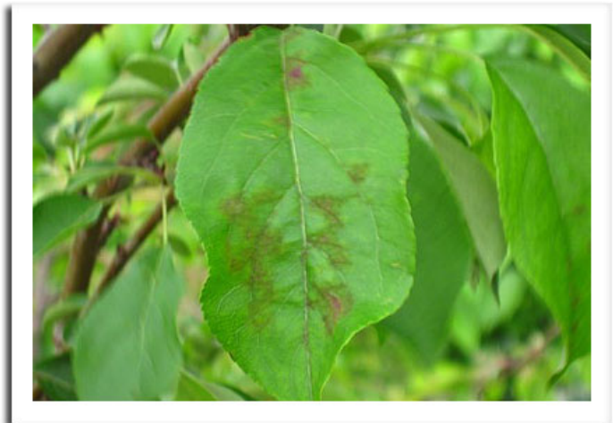
Apple scab on crabapple

disease. Infected leaves initially develop brown or olive lesions that later turn black. These primary spring infections produce secondary spores which continue to infect leaves and fruits during wet periods throughout the growing season, often resulting in severe defoliation. Cultural practices such as pruning, planting resistant varieties, thorough sanitation, and careful watering can usually control apple scab. Fallen leaves should be removed in autumn to reduce the amount of inoculum available to start the infection cycle the following year. Fungicides are generally not warranted for nursery stock, except in years when the disease is particularly severe.