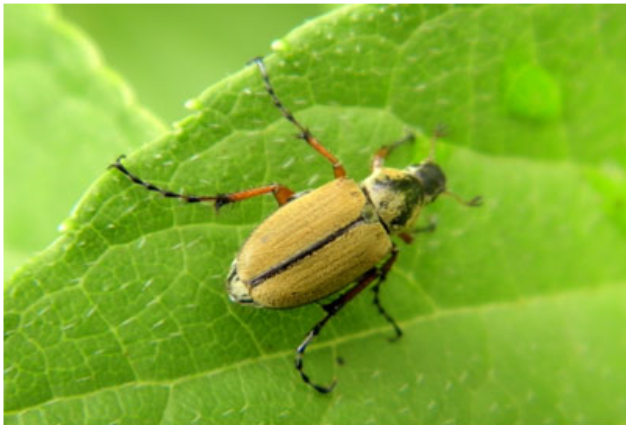
Rose chafer beetle

SOYBEAN DEFOLIATORS: An assortment of minor defoliators can be found at very low levels in many soybean fields. Included in this category are bean leaf beetles, green fruitworm larvae, grasshopper nymphs and rose chafers, all of which were noted on fewer than 4% of plants examined in fields surveyed from June 16-22. Prebloom soybean fields with combined defoliation rates of 30% or more may qualify for treatment, though defoliation in the vegetative stages seldom results in yield loss, especially when soil moisture, temperatures and other growing conditions are favorable. The economic threshold is lowered to 20% defoliation once soybeans reach the bloom and post-bloom stages.