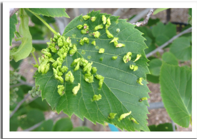
Linden leaf gall mite

LINDEN LEAF GALL MITE: The distinctive nail-shaped galls caused by this mite are appearing on lindens in Oneida County. The galls are the result of early-spring feeding by the overwintered mites that passed the winter on sheltered parts of the tree. At this time of season the galls are greenish yellow, but eventually turn reddish-brown. LLGM specializes on plants in the genus Tilia and occurs on littleleaf linden and basswood trees. The galls usually form on the shaded, lower leaves and are mostly a cosmetic problem.