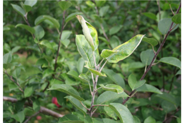
Potato leafhopper damage to apple foliage

crop hay increases. Non-bearing, one- to two-year-old trees are most susceptible to leafhopper feeding and should be monitored for upwards leaf cupping and yellowing of terminal shoots caused by the adults and nymphs. Treatment is justified at levels of one or more nymphs per leaf when symptoms are apparent.