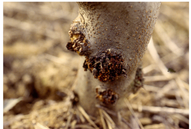
Dogwood borer injury

DOGWOOD BORER: Pheromone traps can be placed now to provide information on the size and timing of the moth flight, as well as the subsequent larval hatch expected in July.