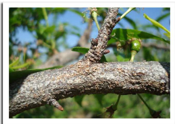
San Jose scale on plum

branches over the course of a few days, or 10 crawlers on one tape with zero on all other tapes, may warrant application. Treatments should be applied once the yellow crawlers are active, but before their white, waxy coverings (white cap stage) start to form on the leaves and branches. Conventional products for summer control include Esteem (pyriproxyfen) or Movento (spirotetramat). Options for organic growers are summer oil and biological control.