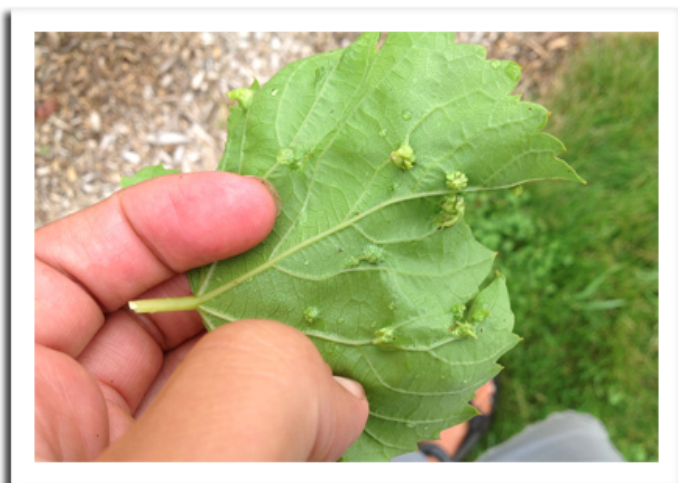
Grape phylloxera galls

GRAPE PHYLLOXERA: Grape growers concerned about the appearance of phylloxera galls on grape foliage are reminded that insecticide treatments should have been applied at the first sign of gall formation earlier this month. No insecticide can reduce or eliminate the galls once they have formed on the leaves.