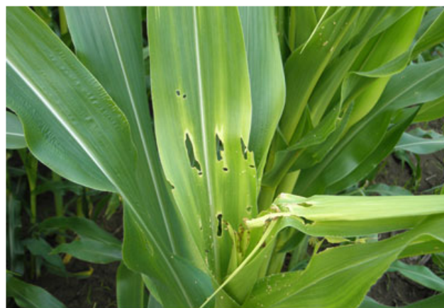
Stalk borer damage

and Richland counties had leaf feeding on 10-12% of the plants in the first four edge rows, but significant damage was not expected since the corn was in the V7-V8 stages.