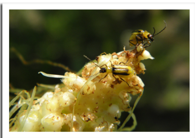
Western corn rootworm beetles

CORN ROOTWORM: Corn producers can expect to see the first beetles of the year and evidence of root damage starting by early July. Egg hatch has been underway since late May and should peak during the week of June 26-July 2 across much of southern and central Wisconsin. Evaluation of corn roots for pruning is recommended beginning 7-10 days after 50% rootworm egg hatch. Continuous corn and areas with Bt performance issues should be the highest priority for inspection and root ratings.