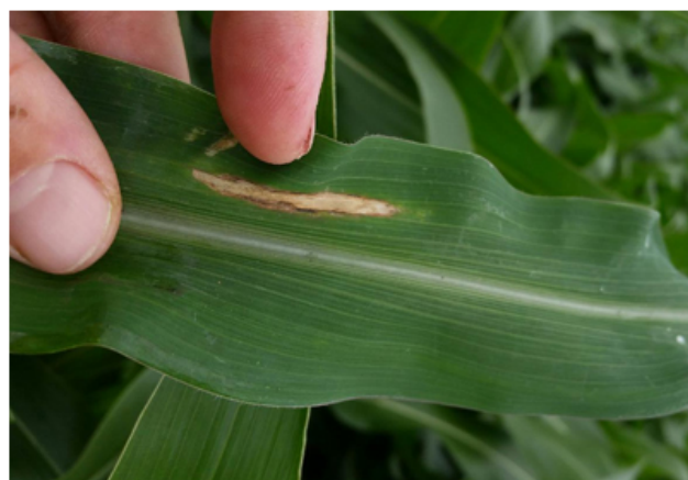
Northern corn leaf blight lesion