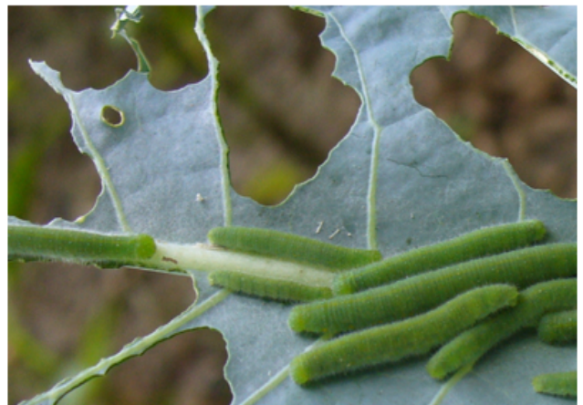
Imported cabbageworm larvae

IMPORTED CABBAGEWORM: Moths are very active in gardens and egg laying has intensified. Damage caused by ICW is very conspicuous and the larvae are generally easy to find, making control of this insect relatively easy to accomplish in gardens and smaller plantings. For larger commercial cabbage crops, larval infestations should be assessed on a weekly basis by examining 25-50 randomly-selected plants (depending on field size) and recording the percentage of infestation. A plant is infested if eggs or caterpillars are found. Control decisions should be made based on a threshold of 30% infestation in the transplant to cupping stages and 20% infestation from the cupping to early head stages.