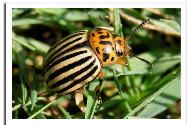
Colorado potato beetle

COLORADO POTATO BEETLE: Emergence of overwintered adults has been noted in west-central Wisconsin, indicating that oviposition on potatoes, tomatoes, eggplants and other host plants should begin before the end of the month. The bright orange-yellow eggs are deposited in clusters of 15-30 on the undersides of leaves. Egg hatch occurs in 4-9 days.