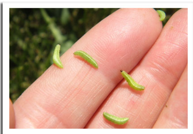
Alfalfa weevil larvae

or more of alfalfa stems in the first crop signals the larval population is high and early harvest would be beneficial.