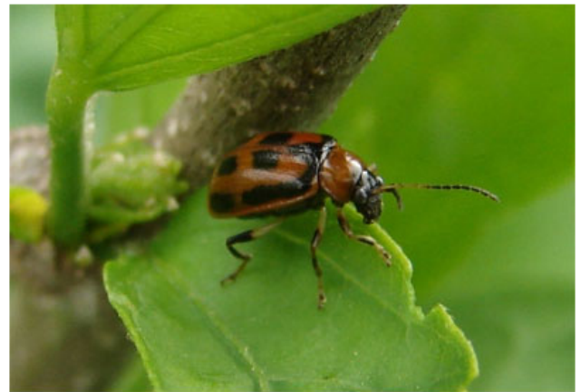
Bean leaf beetle

BEAN LEAF BEETLE: Surveys in alfalfa indicate very few overwintered beetles have emerged so far. However, the earliest planted soybean fields may attract larger numbers of beetles this spring and should be monitored for feeding injury after emergence. Beetle mortality is predicted to have been low during the winter of 2015-2016 based on the mild temperatures recorded. Damage by this pest is more common and severe in fields that are first to emerge or are isolated from other soybean acres. Overwintered beetles were collected for the first time this season on May 3 from Richland County alfalfa.