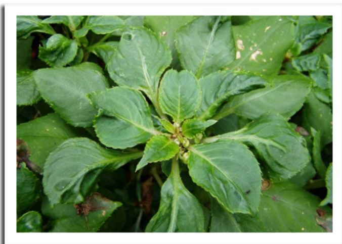
Broad mite damage on impatiens

BROAD MITES: Mite infestations were found this week on begonias and gerberas at a greenhouse in Racine County. The toxic saliva produced by these tiny (0.3 mm) mites results in curling, hardening and twisting at growing points of the plant, symptoms similar to herbicide damage. Broad mites are best managed by isolating and treating infested plants with an appropriate miticide.