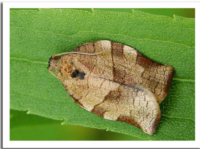
Obliquebanded leafroller moth

experienced late-season OBLR problems in recent years should consider setting additional traps to identify problem areas and help determine where to direct management efforts later this season. Scouting for foliar feeding is also suggested at this time. Control may be warranted if feeding damage affecting more than 5% of terminals or 3% of fruit clusters is observed.