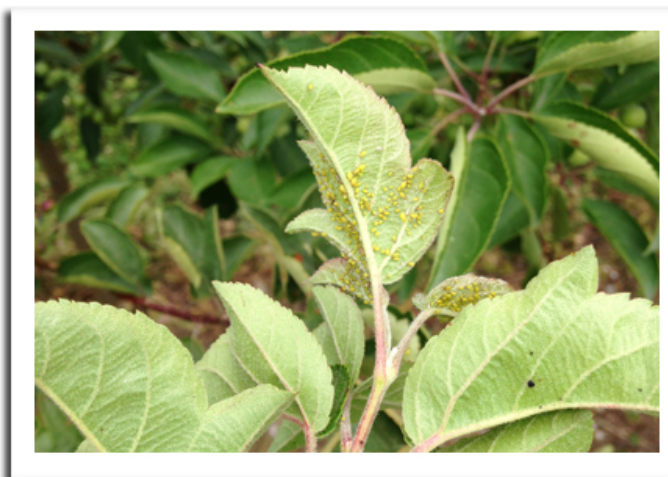
Aphids on apple leaves

APHIDS: These insects were observed on various annuals and apple trees at retailers in Ozaukee and Racine counties. Aphids are difficult to control in greenhouses due to their high reproductive capacity and resistance to insecticides. Early detection and control requires weekly scouting of plants prior to flowering. Should treatment be justified, two applications of an insecticide registered for aphid control are typically needed. Insecticidal soaps and horticultural oils kill by contact, so thorough coverage of the undersides of leaves is critical.