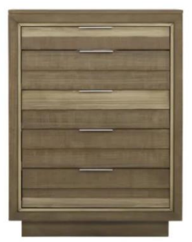
BFG North Carolina Recalls Chest of Drawers Due to Tip-Over and Entrapment Hazards; Sold Exclusively at Rooms To Go (Recall Alert) | CPSC.gov

What to do: Consumers should immediately stop using the recalled chests and contact Rooms to Go for a free in-home repair by trained technicians, free replacement, or a full refund of the purchase price in the form of a Rooms to Go store credit, including free pick-up of the chest. Rooms to Go is contacting all known purchasers directly. Consumers can also contact Rooms to Go toll-free at 855-688-0919 Monday through Friday from 9 a.m. to 4 p.m. ET, email at <a href="mailto:productcare@roomstogo.com">productcare@roomstogo.com</a>, or online at <a href="mailto:www.riverstreetrecall.com">www.riverstreetrecall.com</a> or <a href="mailto:www.brazilfurnituregroup.com">www.brazilfurnituregroup.com</a> and click on Recalls on the top of the page for more information.