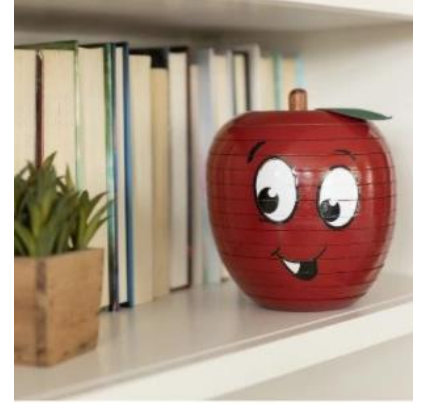
Stack Em' Up Books Recalls Children's Stackable Toys Due to Violation of the Federal Lead Paint Ban and Lead Poisoning Hazard | CPSC.gov

What to do: Consumers should immediately take the recalled toys away from children and contact Stack Em' Up Books to receive a pre-paid shipping label to return the recalled product, regardless of whether they purchased the product or received it as a free giveaway. Consumers that purchased the product at <a href="www.stackemupbooks.com">www.stackemupbooks.com</a> or the Philadelphia Gift Show will receive a full refund once they return the product. Consumers can also contact Stack Em' Up Books collect at 267-987-3328 from 9 a.m. to 5 p.m. ET, email at <a href="contact@stackemupbooks.com">contact@stackemupbooks.com</a>, or online at <a href="www.stackemupbooks.com">www.stackemupbooks.com</a>/pages/cpsc-volutary-recall-information or stackemupbooks.com and click on the CPSC Voluntary Recall 2021-2022 link at the bottom of the page for more information.