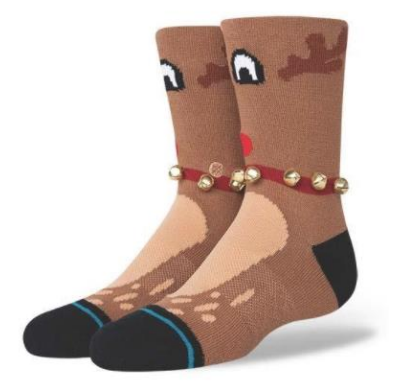
Stance Recalls Kids Crew Socks Due to Choking Hazard | CPSC.gov

What to do: Consumers should immediately stop using and return the recalled socks to a Stance store or contact Stance at info@stance.com to receive instructions for a pre-paid shipping label to return the recalled socks. Upon return of the recalled socks, consumers will receive a refund in the form of a credit of up to $20 to use on their next purchase on Stance.com or at a Stance retail store. This credit is not transferrable, is not redeemable for cash and is a one-time usage code. Consumers can also contact Stance toll-free at 888-391-9020 from 9 a.m. to 5 p.m. PT Monday through Friday, email at info@stance.com, or online at www.stance.com/support/recall or www.stance.com and click on Product Recall at the bottom of the page for more information.