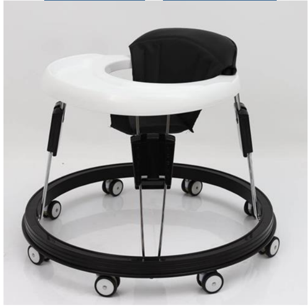
Zeno Recalls Infant Walkers Due to Fall and Entrapment Hazards (Recall Alert) | CPSC.gov

What to do: Consumers should immediately stop using the recalled infant walkers and contact Zeno via e-mail to receive a shipping label to return the infant walker free of charge. Upon receipt of the infant walker, consumers will be issued a full refund of the purchase price. Zeno is notifying all known purchasers directly. Consumers can also contact Zeno Inc. by e-mail at cs@zeno999.com or sally@zeno999.com