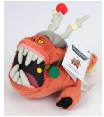
Games Workshop Recalls Koyo Bounca The Squig Plush Toys Due to Choking Hazard | CPSC.gov

What to do: Consumers should immediately take the recalled plush toy away from young children and return the toy to any Games Workshop or Warhammer store for a full refund, or destroy the product by cutting off the tail with scissors and provide photographic proof of destruction by emailing the photo to <a href="mailto:custserv@gwplc.com">custserv@gwplc.com</a> or uploading photo using the form at <a href="mailto:https://www.games-workshop.com/recall">https://www.games-workshop.com/recall</a> for a full refund. Consumers can also contact Games Workshop toll-free at 877-426-0130 from 7 a.m. to 6 p.m. ET Monday through Friday, email at <a href="mailto:custserv@gwplc.com">custserv@gwplc.com</a> or online at <a href="mailto:games-workshop.com/recall">games-workshop.com/recall</a> or at <a href="mailto:www.games-workshop.com">www.games-workshop.com</a> and click on "Recalls" at the bottom of the page for more information.