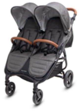
Valco Baby Recalls Snap Duo Trend Strollers Due to Fall Hazard | CPSC.gov

What to do: Consumers should immediately stop using the recalled strollers and contact Valco Baby to receive a free replacement front wheel assembly and instructions for replacement. Valco Baby is contacting all known purchasers directly. Consumers can also contact Valco Baby at 800-610-7850 from 10 a.m. to 4 p.m. ET Monday through Friday or anytime online at <a href="www.valcobaby.com/recall">www.valcobaby.com/recall</a> or <a href="www.valcobaby.com">www.valcobaby.com</a> and click on Recall or by email at <a href="recall@valcobaby.com">recall@valcobaby.com</a> for more information and to order a replacement set of wheels.