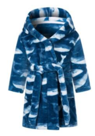
Children's Robes Recalled Due to Violation of Federal Flammability Standards and Burn Hazard; Imported by BAOPTEIL; Sold Exclusively on Amazon.com | CPSC.gov

What to do: Consumers should immediately take the recalled robes away from children and stop using them. Consumers who purchased the robes from Amazon will be contacted through Amazon's messaging platform and provided prepaid mailers to return the robes for a full refund. Consumers can also contact BAOPTEIL to request a postage prepaid mailer to return the robes for a full refund. Consumers can contact BAOPTEIL via email at 244882378@qq.com.