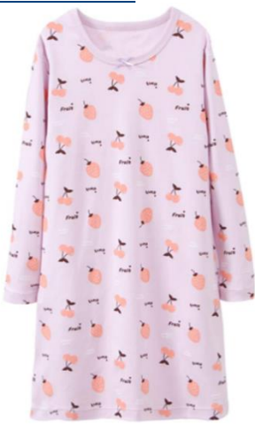
Children's Nightgowns Recalled by AllMeInGeld Due to Violation of Federal Flammability Standards and Burn Hazard; Sold Exclusively on Amazon.com | CPSC.gov

What to do: Consumers should immediately take the recalled nightgowns away from children and stop using them. Consumers who purchased the garments from Amazon.com will be contacted through Amazon's messaging platform and provided prepaid mailers to return the products for a full refund. Consumers can also contact AllMeInGeld to request a postage prepaid mailer to return the products for a full refund. Consumers can also contact AllMeInGeld email at yong-yi.US@outlook.com.