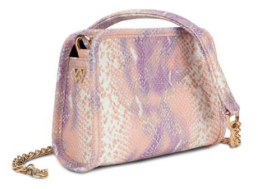
<u>Kelly Wynne Recalls Children's Handbags</u> <u>Due to Violation of Federal Lead Content Ban</u> (Recall Alert) | CPSC.gov

What to do: Consumers should immediately take the recalled handbags away from children and contact Kelly Wynne for a full refund if purchased at kellywynne.com or contact Nordstrom if purchased at Nordstrom.com. Kelly Wynne and Nordstrom are contacting all known purchasers directly, and will provide pre-paid shipping labels for consumers to return the recalled product for a full refund. Consumers can also contact Kelly Wynne LLC collect at 512-472-5762 from 9 a.m. to 4 p.m. CT Monday through Friday, email at recall@kellywynne.com, or online at https://kellywynne.com/pages/consumerinformation or kellywynne.com and click on Consumer Information at the bottom of the page for more information.