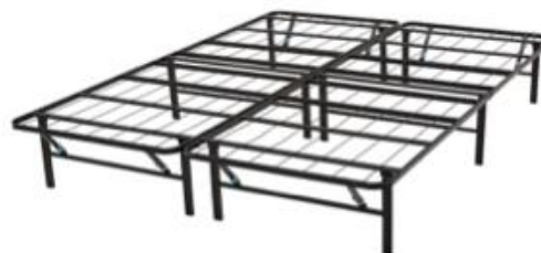
Global Home Imports Recalls Platform Bed Frames Due to Serious Injury Hazard | CPSC.gov

What to do: Consumers should immediately stop using the recalled HR Platform Frames and contact Global Home Imports to receive a free repair kit with metal clips to strengthen the frame. Global Home Imports will ship a kit directly to consumers free of charge. Consumers can contact Global Home Imports toll-free at 888-550-4371 from 8 a.m. to 4 p.m. MT Monday through Friday, email at recall@bedtech.com or online at www.bedtech.com and click on HR Recall for more information or www.bedtech.com/hr-platform-recall .