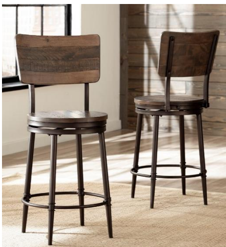
Hillsdale Furniture Recalls Jennings Counter and Bar Stools Due to Fall Hazard | CPSC.gov

What to do: Consumers should immediately stop using the recalled Jennings counter and bar stools and contact Hillsdale Furniture for a free repair kit. Consumers can contact Hillsdale Furniture at 800-832-1777 from 9 a.m. to 5 p.m. ET Monday through Friday, email at recall@hillsdalefurniture.com , or online https://hillsdalefurniture.com and click on "Product Recalls" located at the bottom of the page for more information.