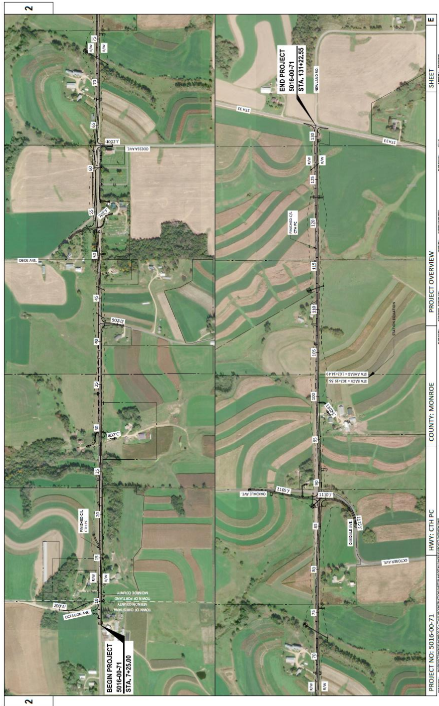
Figure 1a: The proposed start, end locations for the reconstruction of County Highway (CTH) PC in Monroe County, WI (Jewell, 2023). Note , the project overview depicted in Figure 1a portrays a stacked map- the right half of the map sheet portrays the project corridor traveling northerly from the end point on the top of the left half of the map sheet.