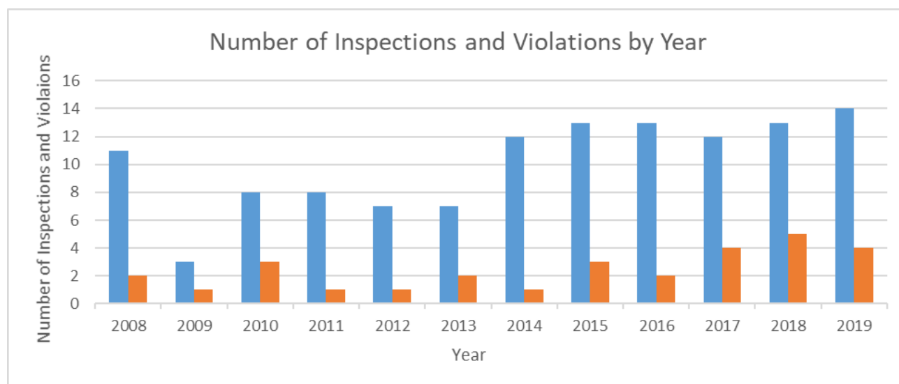
Table 1: Atrazine Illegal-Use Inspections and Violations

Notes: ■ Number of atrazine illegal-use inspections within stated year. ■ Number of violations associated with an atrazine illegal-use inspection within the stated year.