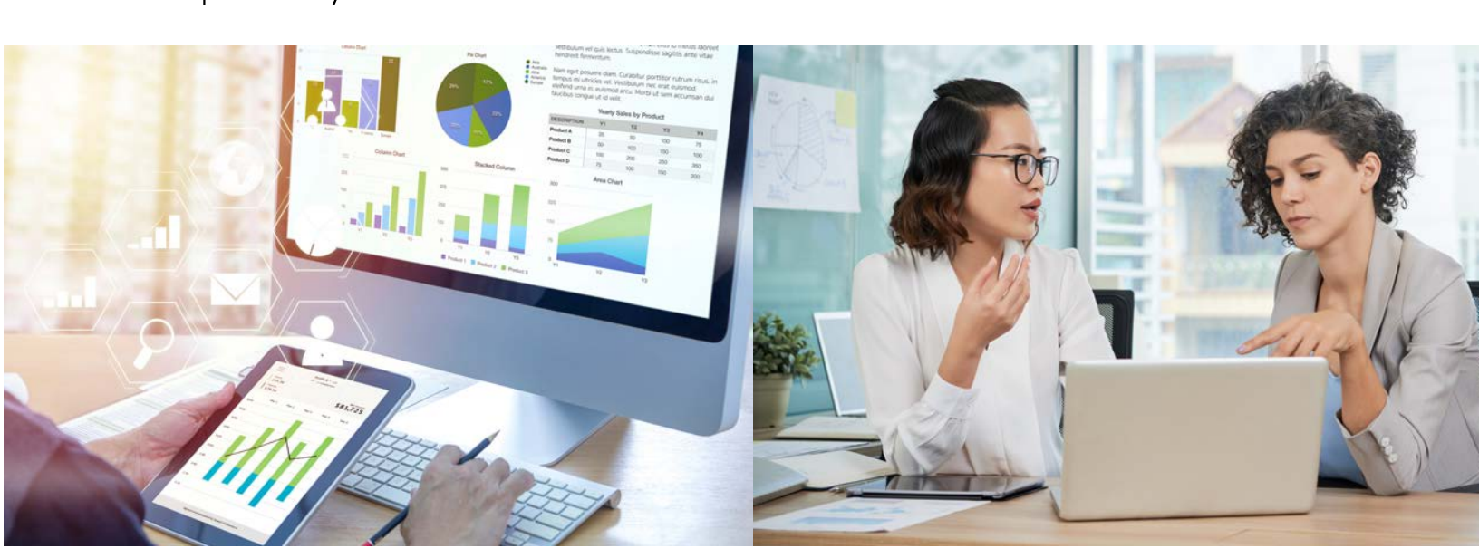
[6] WISERTrade supplies accurate and comprehensive data on international trade flows with analytics to support essential global strategic decisions and problem solving. WISERTrade is used to obtain the trade values from the U.S. Census Trade Data Set.

WEDC and DATCP evaluate export data from the U.S. Census Trade Data Set through WISERTrade [6], and utilize industry market reports from the USDA Foreign Agriculture Service, U.S. Commercial Service, and other public and private sources. In evaluating market demand, consideration is also given to population growth, gross national product, strength of the purchasing power, and other demographic factors. WEDC subscribes to the export data tools and provides access to DATCP. WEDC and DATCP make decisions regarding the top markets and markets with growth potential, which influence selections of trade promotion activities. The analyzed data is also used by companies to inform their individual company's export decisions. The export data and opportunity markets are evaluated annually to determine if others should be added and trade promotion activities modified or changed. In addition, WEDC and DATCP monitor economic, political and trade-related news to determine if more immediate action is necessary regarding trade promotion activities and informing the companies they serve.