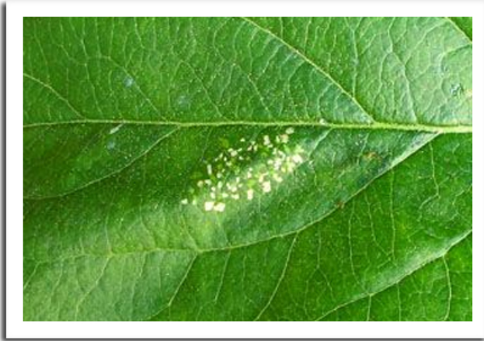
Spotted tentiform leafminer mine Tomasz Binkiewicz www.lepidoptera.eu

or a history of infestation may consider treatment of second generation larvae to reduce build-up of leafminers before the third flight begins in August. The highest trap count for the week ending July 10 was 1,262 moths in Marathon County.