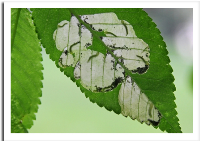
Elm leafminer sawfly larvae

leaves with mines caused by this species ( Fenusa ulmi ). Unlike the native elm sawfly, the elm leafminer sawfly is endemic to Europe and Asia. The larval stages damage foliage by mining the mesophyll tissue between the upper and lower epidermis, creating visible blotchy leaf mines. Damage is considered mostly aesthetic, though treatment targeting adults can be warranted in rare situations to control severe infestations.