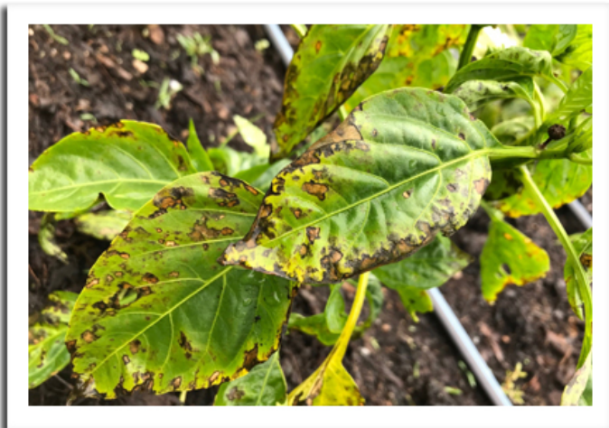
Bacterial spot on bell pepper

Infected seed is an important source of the bacterium that causes BLS in pepper. Therefore, the use of disease-free seed and transplants are important in BLS management. Infected plant debris and weeds are additional sources of the pathogen and must also be eliminated to reduce the amount of the pathogen available to initiate disease.