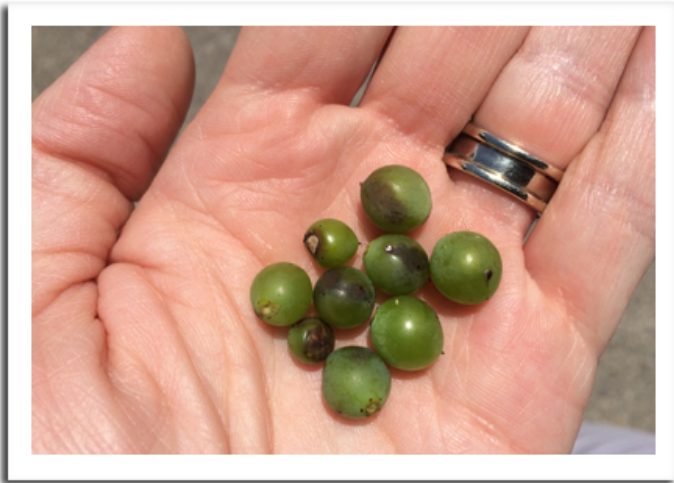
Grapes infested with grape berry moth larvae Krista Hamilton DATCP

GRAPE BERRY MOTH: Female moths will soon begin laying second-generation eggs in southern and western Wisconsin vineyards. Scouting for infested fruits and other signs of GBM, particularly in border rows adjacent to wooded areas in the vineyard, is advised. Treatment of perimeter rows, if warranted, usually provides satisfactory control of this pest. The use of pheromone traps to monitor GBM flights and properly timed controls is also strongly recommended.