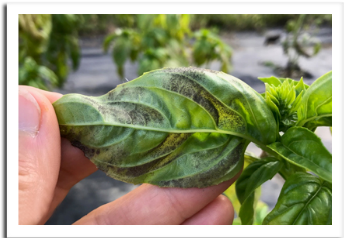
Basil downy mildew

BASIL DOWNY MILDEW: This disease was confirmed by the UW on basil in south-central Wisconsin last week. First reported in Wisconsin in 2010, basil downy mildew (BDM) can rapidly destroy entire basil crops. Diagnostic characteristics include yellowing and downward curling of foliage and grayish-purple, fuzzy sporulation on leaf undersides. This disease can spread by infected seed, transplants or by windblown spores and thrives under moderate temperatures and high humidity, with symptoms progressing from the lower leaves upward.