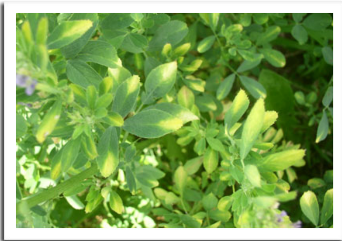
Alfalfa with hopperburn

alfalfa 8-11 inches and 2.0 per sweep for fields 12 inches or taller in height.