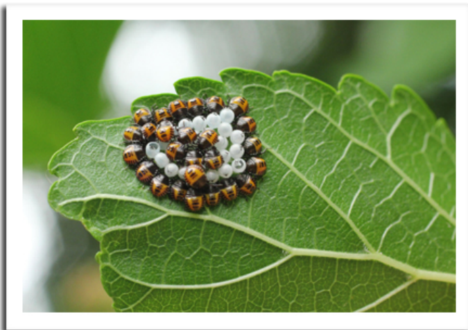
Brown marmorated stink bug nymphs and eggs

BROWN MARMORATED STINK BUG: Newly hatched brown marmorated stink bug (BMSB) nymphs were observed in Madison on June 29, confirming the start of the first-generation of stink bugs in Dane County. BMSB is thought to have a single generation per year in Wisconsin depending on temperatures, although an early spring and summer heat could permit the development of two generations in warmer years.