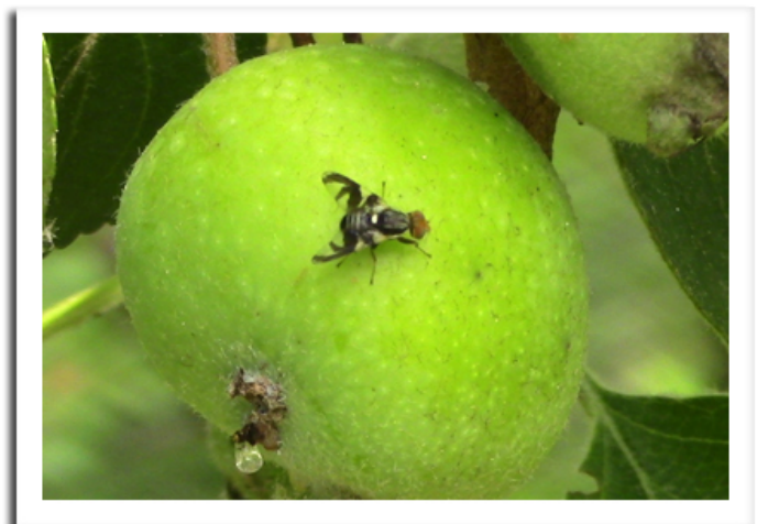
Apple maggot fly

APPLE MAGGOT: Emergence of adults began this week, with captures of 1-2 flies reported from cooperating orchards in Fond du Lac, Iowa and Sheboygan counties. Apple maggot traps should be cleaned of non-target flies periodically and recoated with insect sticky trap material as needed.