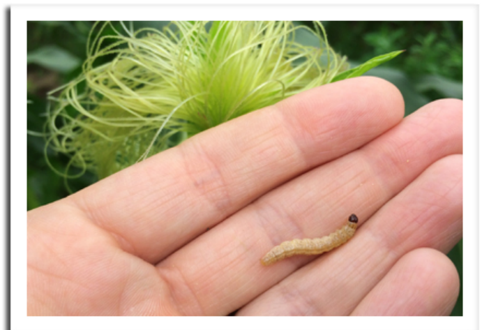
Fifth-instar European corn borer larva

EUROPEAN CORN BORER: Larval infestation rates are generally less than 5% in surveyed fields. Corn borer caterpillars range in development from second to fifth instar, with the third instar being the most prevalent stage. Only 5% of the cornfields sampled from July 4-10 had signs of ECB infestation.