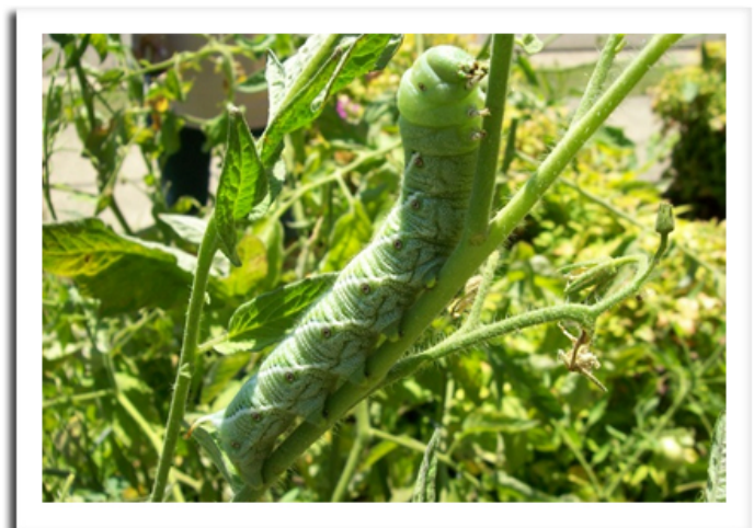
Tomato hornworm larva

TOMATO HORNWORM: Moths have begun laying eggs on the undersides of tomato leaves in southern Wisconsin. Tomato growers who have experienced past problems with this pest should start inspecting plants for the smooth, spherical, pale green eggs deposited individually on the lower surface of leaves. Once the eggs hatch, the larvae grow rapidly and can quickly defoliate plants. Prompt removal of the larvae is the best control measure.