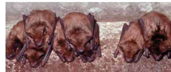
Big brown bat ( Eptesicus fuscus )