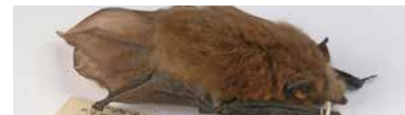
Common pipistrelle ( Pipistrellus pipistrellus ) Bugwood.org

Wisconsin Department of Agriculture, Trade and Consumer Protection