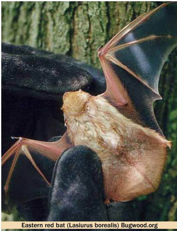
Eastern red bat ( Lasiurus borealis )

Because rabies is a fatal disease, the goal of public health is, first, to prevent human exposure to rabies by education and, second, to prevent the disease by anti-rabies treatment if exposure occurs. Tens of thousands of people are successfully treated each year after being bitten by an animal that may have rabies. A few people die of rabies each year in the United States, usually because they do not recognize the risk of rabies from the bite of a wild animal and do not seek medical advice.