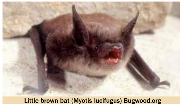
Little brown bat ( Myotis lucifugus )