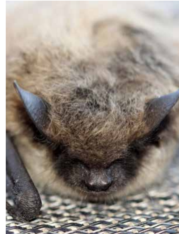
Little brown bat ( Myotis lucifugus )