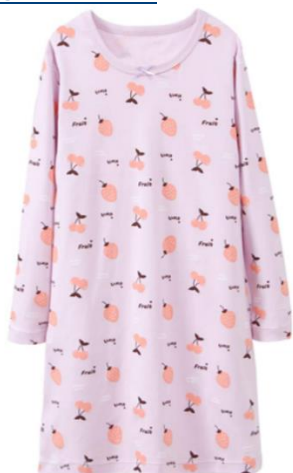
Children's Nightgowns Recalled by AllMeInGeld Due to Violation of Federal Flammability Standards and Burn Hazard; Sold Exclusively on Amazon.com | CPSC.gov

What to do: Consumers should immediately take the recalled nightgowns away from children and stop using them. Consumers who purchased the garments from Amazon.com will be contacted through Amazon's messaging platform and provided prepaid mailers to return the products for a full refund. Consumers can also contact AllMeInGeld to request a postage prepaid mailer to return the products for a full refund. Consumers can also contact AllMeInGeld email at yong-yi.US@outlook.com .