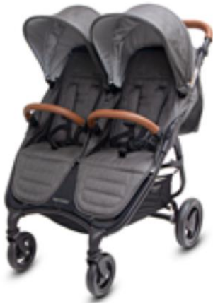
Valco Baby Recalls Snap Duo Trend Strollers Due to Fall Hazard | CPSC.gov

What to do: Consumers should immediately stop using the recalled strollers and contact Valco Baby to receive a free replacement front wheel assembly and instructions for replacement. Valco Baby is contacting all known purchasers directly. Consumers can also contact Valco Baby at 800-610-7850 from 10 a.m. to 4 p.m. ET Monday through Friday or anytime online at www.valcobaby.com/recall or www.valcobaby.com and click on Recall or by email at recall@valcobaby.com for more information and to order a replacement set of wheels.