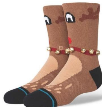
Stance Recalls Kids Crew Socks Due to Choking Hazard | CPSC.gov

What to do: Consumers should immediately stop using and return the recalled socks to a Stance store or contact Stance at info@stance.com to receive instructions for a pre-paid shipping label to return the recalled socks. Upon return of the recalled socks, consumers will receive a refund in the form of a credit of up to $20 to use on their next purchase on Stance.com or at a Stance retail store. This credit is not transferrable, is not redeemable for cash and is a one-time usage code. Consumers can also contact Stance toll-free at 888-391-9020 from 9 a.m. to 5 p.m. PT Monday through Friday, email at info@stance.com , or online at www.stance.com/support/recall or www.stance.com and click on Product Recall at the bottom of the page for more information.